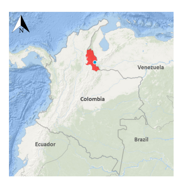
Figure 1. Map of the study site located the State of Norte de Santander, Colombia.

The protocols and methods for this study were reviewed and approved by the Kansas State University Ethics Review Board (IRB#8753) and The Los Patios Hospital Board. This study was conducted in Los Patios, in the State of Norte de Santander, which is located in the northeast of Colombia (Figure 1). Volunteers seeking medical attention in the hospital due to febrile illness and referred to the clinical laboratory for further hematological testing were approached by a research team member and asked to participate in the study. The objectives of the research were clearly explained to each potential participant (legal guardian or parent for children) and written informed consent was obtained prior to sample collection. A blood sample was only collected from people who agreed to be part of the study. In our current study, a "probable dengue case" is defined as a person with clinical symptoms and hematological findings compatible with dengue fever but without a confirmatory test. Furthermore, a person is classified as a "confirmed dengue case" when a diagnostic test (RDT or molecular test) is found to be positive for DENV infection.