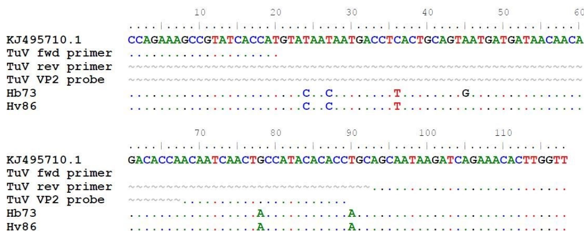
Figure 2. Alignment of the 118 nt sequenced qPCR amplicons from TuV DNA-positive stool samples in the current study to the only published TuV reference sequence KJ495710.1 (3085–3202 bp). Dot (.) indicates identical nucleotides and tilde (~) lacking nucleotides.

spectively, compared to the only known TuV sequence KJ495710.1, also serving as positive control in qPCR (Figure 2). There were no more stool materials left for further sequencing of longer amplicons.