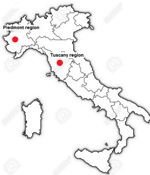
Figure 2. Location of participatory forums at sub-national level.