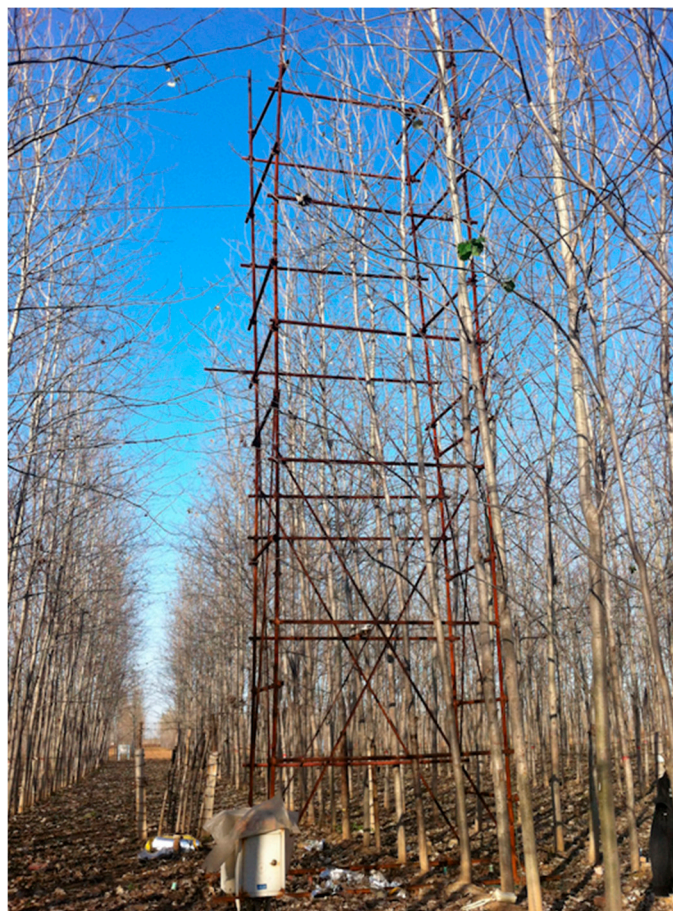
Figure S1. The stell scaffold around the sample tree.