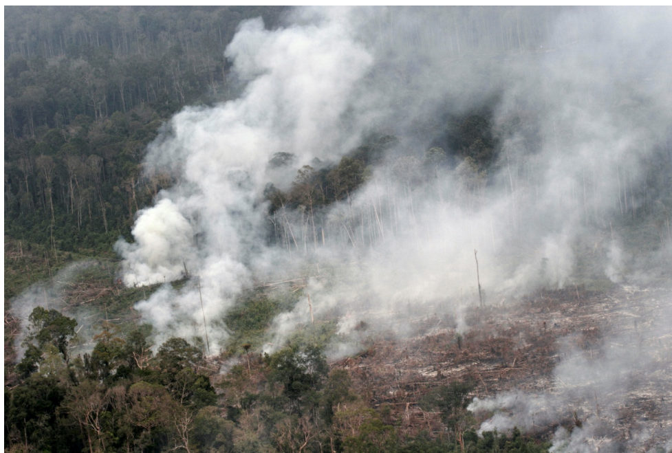
Figure 3. A destructive forest fire near Riau in central Sumatra, Indonesia.

A key priority is to consider both natural climatic variability and the prospects of future climatic change in conservation planning [26]. Current climate models suggest that El Niño droughts will increase in intensity in the western Pacific region [27], which includes Borneo. Such droughts, in concert with logging, forest fragmentation, and fire-based swidden farming, can lead to intense forest fires (Figure 3) that have severe impacts both on forests and on agricultural lands and human livelihoods [28]. Special measures, such as effectively enforced government bans on burning, may become essential during future droughts.