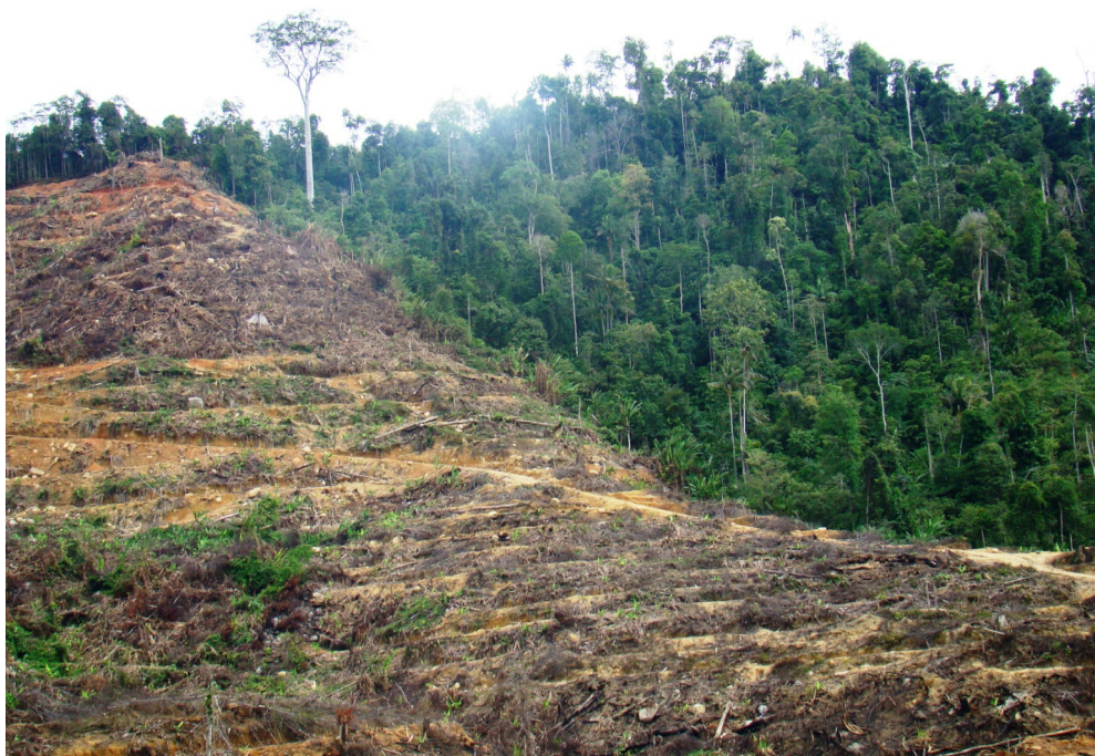
Figure 2. The forests surrounding many protected areas are being rapidly cleared or degraded. Shown is recent deforestation for oil palm plantations along the edge of Bukit Palong National Park in Peninsular Malaysia.

Many protected areas across the tropics are suffering biologically as they become increasingly isolated from surrounding forests (Figure 2) [7]. For this reason it is essential to reduce forest loss and maintain biological connectivity wherever possible in the vulnerable lands surrounding protected areas. Particularly notable are efforts by the Sabah Forestry Department and Sabah Foundation to establish forest corridors and buffer zones in the greater Danum Valley area [2]. This area is notable for containing some of the last remaining tracts of unhunted forests in all of Borneo, parts of which have never been logged. The corridors are linking together several protected areas in eastern Sabah while attempting to provide linkages between surviving lowland and upland forests. Because they harbor considerable biodiversity [10–12], selectively logged forests can provide effective buffer zones and connecting elements for such forest-conservation networks.