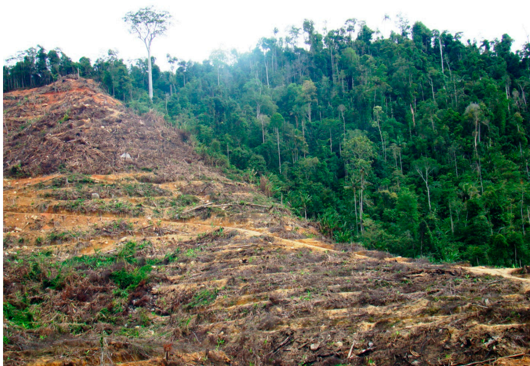
Figure 2. The forests surrounding many protected areas are being rapidly cleared or degraded. Shown is recent deforestation for oil palm plantations along the edge of Bukit Palong National Park in Peninsular Malaysia.

Many protected areas across the tropics are suffering biologically as they become increasingly isolated from surrounding forests (Figure 2) [7]. For this reason it is essential to reduce forest loss and maintain biological connectivity wherever possible in the vulnerable lands surrounding protected areas. Particularly notable are efforts by the Sabah Forestry Department and Sabah Foundation to establish forest corridors and buffer zones in the greater Danum Valley area [2]. This area is notable for containing some of the last remaining tracts of unhunted forests in all of Borneo, parts of which have never been logged. The corridors are linking together several protected areas in eastern Sabah while attempting to provide linkages between surviving lowland and upland forests. Because they harbor considerable biodiversity [10–12], selectively logged forests can provide effective buffer zones and connecting elements for such forest-conservation networks.