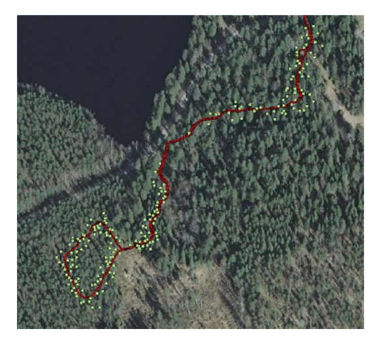
Figure 2. The reference trajectory (red) and the reference trees (green).

the test site using a VRS-GPS device. The measured trees comprised the reference object network. The location accuracy of the reference targets was estimated to be better than 10 cm in 2D (East–North). The route was driven two times to acquire data with different satellite geometry (Table 1). The average driving speed of the ATV was about 4 km/h.