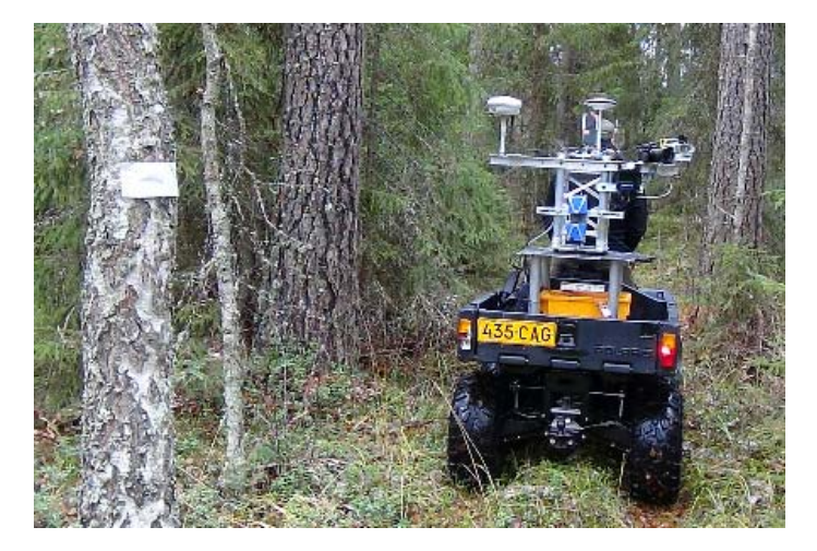
Figure 1. An ATV with global satellite navigation systems (GNSS) antennas and receivers, inertial measurement unit (IMU) and laser scanner equipment mounted on it for the purposes of the study.

Evaluation of the positioning accuracy of a moving vehicle under a forest canopy is quite a challenging task. To evaluate this, a test field consisting of four different forest stands was established. Several different combinations of GNSS and IMU were mounted on an all-terrain vehicle (ATV) (Figure 1). The positions of 224 trees along the driving route were measured using total-station and real-time kinematic GPS. These trees were used to form the network of reference objects. In addition to GNSS and IMU, a laser scanner was mounted on the ATV. Thus, when a laser point cloud was computed using the recorded GNSS and IMU observations and laser scanner measurements, the position of the ATV could be determined based on the reference objects, i.e. , trees, measured from the point cloud. The accuracy of the post-processed GNSS-IMU trajectory could be verified, and this trajectory was used as a reference for several other positioning systems. A large number of forest test plots 32 by 32 m in size were created along the trajectory, and the forest parameters for these test plots were estimated using up-to-date ALS data. This enabled the analysis of how forest parameters affect the accuracy of positioning.