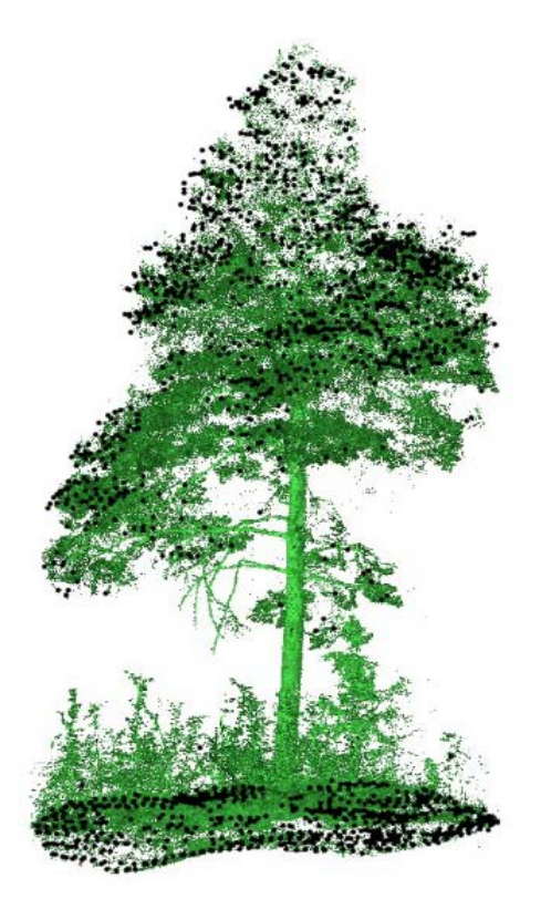
Figure 2. Combination of the TLS (green) and ALS (dark blue) point clouds.

The point clouds provided by the MLS can be characterized by the following parameters: (a) point density of from several hundred to several thousand points per m<sup>2</sup>; (b) XYZ-point accuracy of a few centimeters when the data are collected in good GPS and IMU conditions; and (c) typical target ranges of less than 100 meters. The use of TLS and MLS in scientific work is still in its infancy; thus, the status of MLS is similar to that of the ALS in the late 1990s.