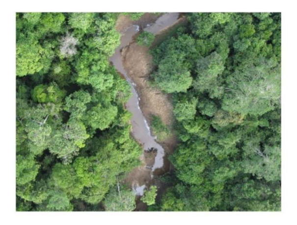
Figure 2. Examples of imagery gathered by small drones that show the extremely high spatial resolution that can be achieved. ( a ) Danau Girang (Sabah, Malaysia); ( b ) Chitwan National Park (Nepal); ( c ) Palm oil plantation by river (Indonesia); ( d ) Recently logged forest (Indonesia).