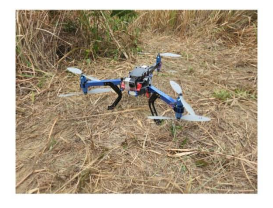
Figure 1. Examples of rotary-wing ( a , b ) and fixed-wing drones ( c - f ) used by ConservationDrones .

on flying altitude is provided by Everaerts [90], another based on flying altitude and range can be found in [40], and a more comprehensive classification following military-standard criteria (though focused on environmental applications) is provided by Watts et al. [45]. Most environmental applications use small drones that have light payloads, can cover relatively short distances, and are only able to fly missions over short periods of time and at low altitudes [91]. Within the category of small drones, we distinguish three main types according to their design and flight mode: (1) various balloons, blimps, kites and paragliders; (2) rotary-wing aircraft; and (3) fixed-wing aircraft (Figure 1 shows rotary- and fixed-wing aircraft that we have used).