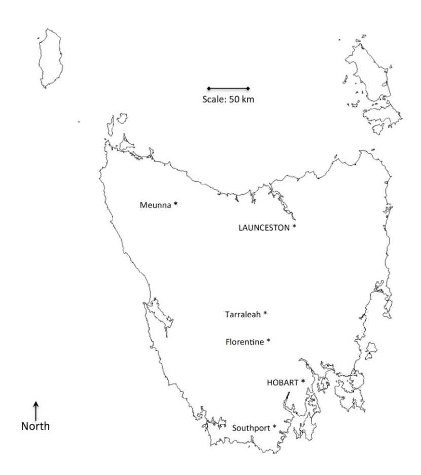
Figure 1. Map of Tasmania showing locations of the four Eucalyptus nitens base population progeny trials.

The trials used a resolvable incomplete block design (Table 2) and spacing at planting was four metres between rows and two metres between trees within rows. Fertiliser (100 g of superphosphate and 125 g of 20:10:0 N:P:K) was applied at the base of each tree three months after planting. Neither thinning nor pruning was undertaken at Tarraleah, Southport or Florentine prior to the current study.