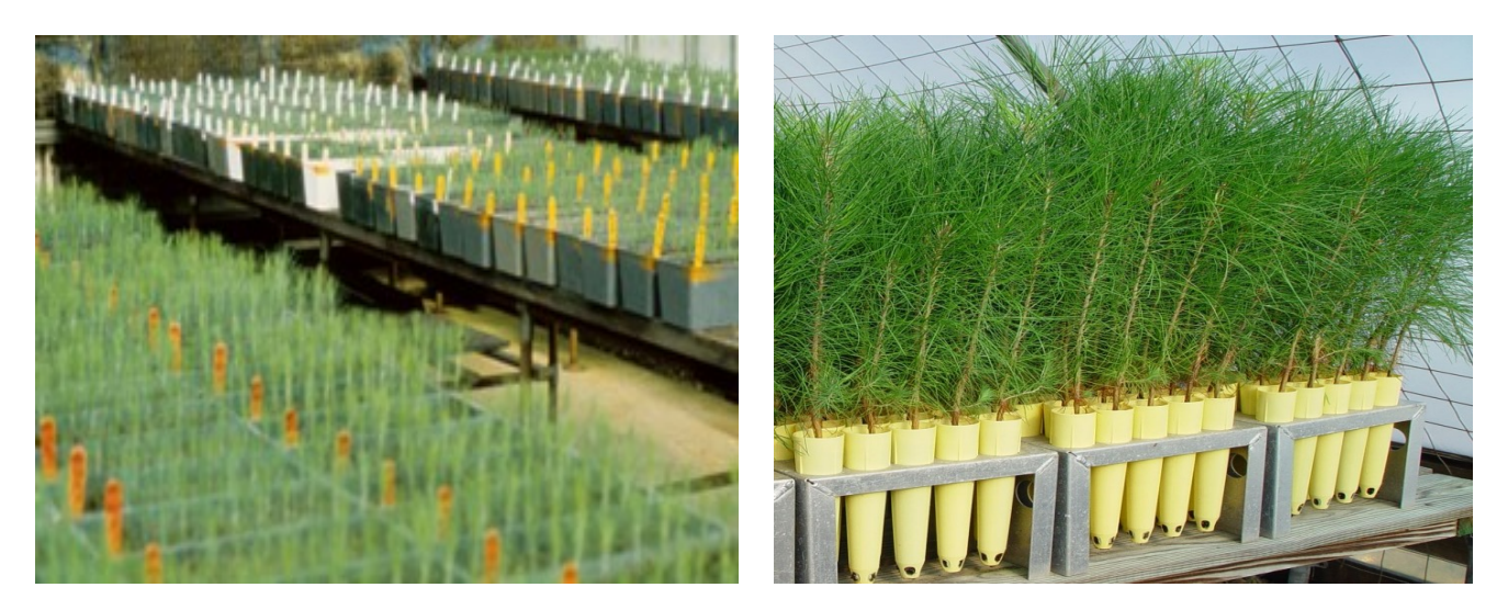
Figure 3. The left panel shows multiple pine seedlings from a specific seed lot that (from 1973–1983) were planted together in trays of locally available mountain topsoil mixed with sand and peat moss. The right panel shows trays of single pine seedlings from a given seed lot that were planted in individual plastic tubes containing a mix of non-sterilized commercially available peat moss, vermiculite, and perlite. These containerized trays of seedlings, each in their individual plastic tubes, were used in all RSC "Operational" and "Research" tests beginning in 1984.