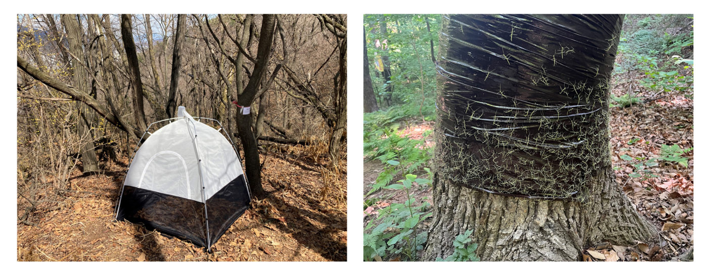
Figure 1. Monitoring the appearance and dispersal of first-instar nymphs of Ramulus mikado using a soil emergence trap ( left ) and a sticky trap ( right ).

In the spring of 2022, the egg hatching of R. mikado was monitored using soil emergence traps (BT2008, BugDorm; Taichung, Taiwan) on Mt. Bong and Mt. Cheonggye (Figure 1 and Table 1). The monitoring sites were classified into three categories: north slope (N), south slope (S), and ridge (R), and the traps were placed on the flat surface of the ground. The appearance of first-instar nymphs of R. mikado was checked every week. Additionally, soil samples containing R. mikado eggs were transferred to the National Institute of Forest Science (NIFoS) on 23 March 2022 (BO_NIFoS and CG_ NIFoS). The soil samples were placed in acrylic cages ( 60 \times 30 \times 30 cm) outdoors at the NIFoS ( 37^{\circ}35'37.7'' N 127^{\circ}02'43.1'' E), and the emergence of the first instars was monitored daily. At three monitoring sites (BO_R-1, CG_R-4, and CG_S-4), the dispersal of first instars was monitored along with egg hatching (Table 1). Five trees around the soil emergence trap were selected, and a sticky trap (RT20-Y100, Daegil Co., Ltd.; Gimhae, Republic of Korea) was rolled up on the tree trunk (Figure 1). Monitoring was conducted until a month after the last appearance or catch of the first instar. The temperature inside the emergence traps was recorded using a HOBO data logger in mid-March.