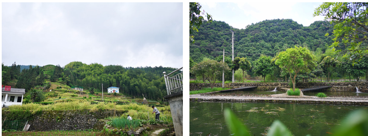
Figure 2. Typical village landscape of QNP (Zuoxi, Qixi County, left ) and the nationally important agricultural heritage: running water fish farming system ( right ).

To better protect the forest and facilitate ecological restoration without land grabbing and high purchasing costs, CEs are introduced through a land-use reform initiated by the QNP management agency as a part of the national park's governance innovation. From March 2018, the park agency designed the implementation plan during the preparation period, and four working groups were set up to disseminate conservation ideology and implementation plan to towns and then villages. The negotiation was a two-step process taking place at the collective level and the village level for the villagers to entrust their contracted forestland to the village committee, and then the park agency signed a contract with the village committee. The contracts were registered from April to November 2020. The registered unit matches that of the forest ownership unit, and a certificate of registration of real estate was issued.