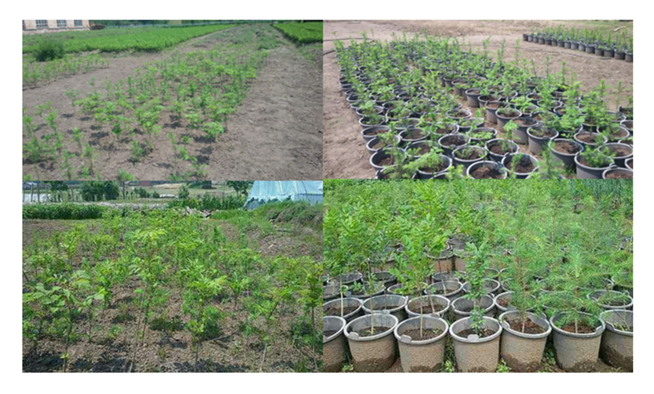
Figure 1. Larch and ashtree young trees planted with mixed banding forests in the field and in pots.