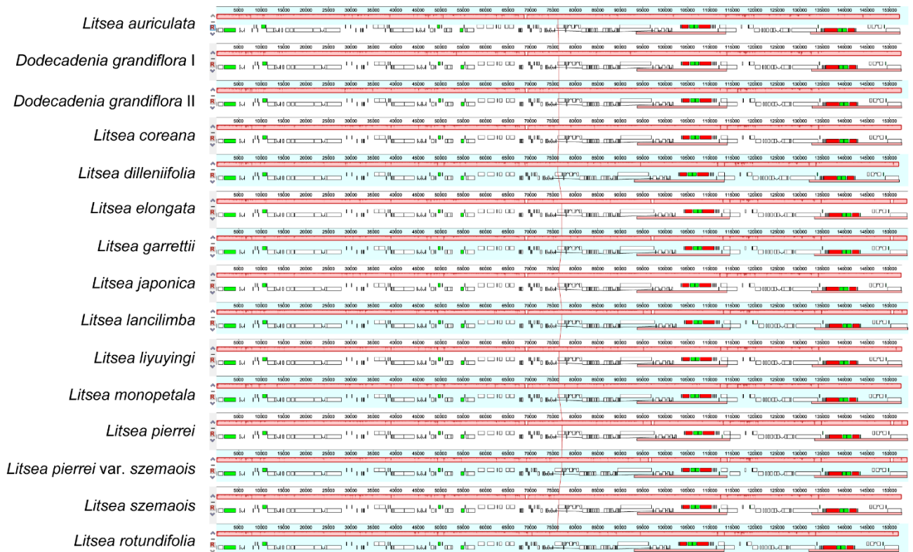
Figure S2 Mauve alignment of D. grandiflora and 13 Litsea cp genome revealing no interspecific rearrangements