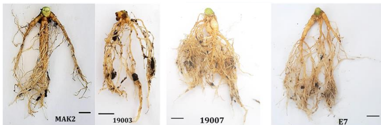
Figure 2. Morphological diversity of the root system of M. volkensii clones after two months of acclimatization under greenhouse conditions (scale bar = 1 cm).