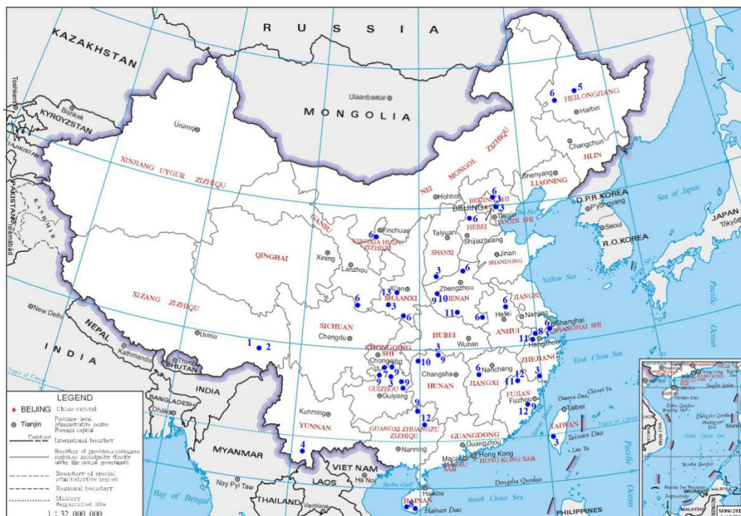
Figure 2. Distribution of the species of Rhopalovalva from China. 1. R. stilliformis sp. nov.; 2. R. spinata sp. nov.; 3. R. cathartotorna (Meyrick, 1935); 4. R. connata Zhang, Bai & Li, 2017; 5. R. exartemana (Kennel, 1901); 6. R. grapholitana (Caradja, 1916); 7. R. lacivana (Christoph, 1882); 8. R. macrocuculla Zhang, Bai & Li, 2017; 9. R. orbiculata Zhang & Li, 2004; 10. R. ovata Zhang & Li, 2004; 11. R. pulchra (Butler, 1879); 12. R. rhombea Zhang & Li, 2010; 13. R. triangulata Zhang & Li, 2010.