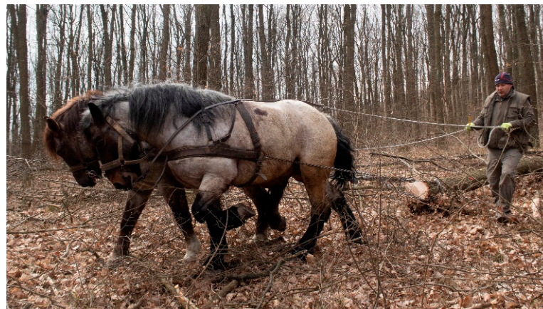
Figure 2. Horses working in pair with a chain, led from the back (area of the Királyrét Forest District, 2021).

The work productivity of animal logging was further determined by the length of the skidding track, the slope angle, the size of the log, and the weather conditions [21,22,30,39] (Table 3). These factors were considered in the price as well that the Hungarian forest district paid for the hired loggers.