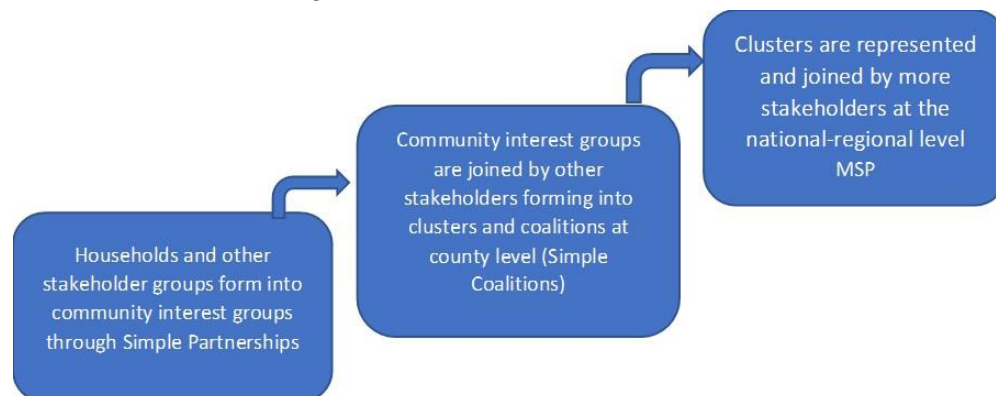
Figure 2. Illustration of coalitions of clusters that make the TKLB MSP.

at the community level would form coalitions that represents household and community interests at the national-regional levels.