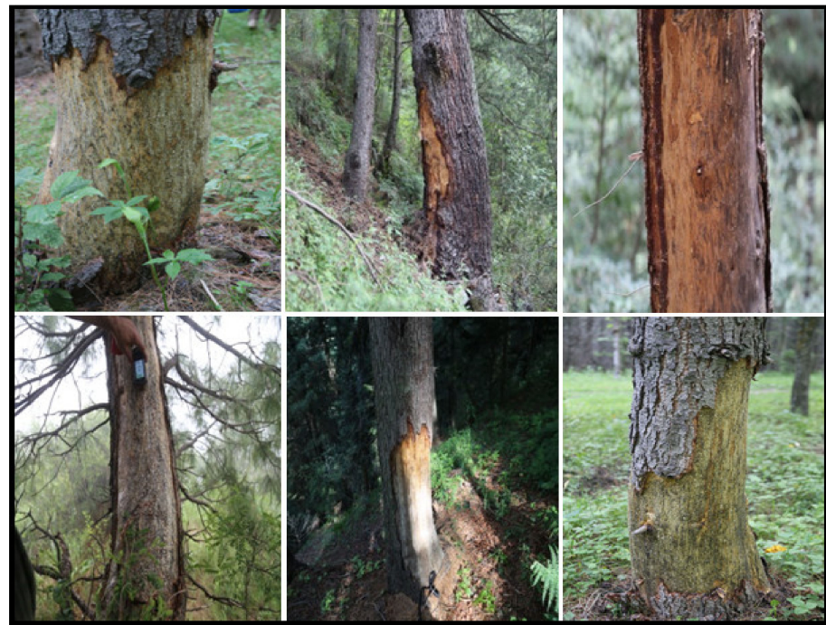
Figure 2. Photos of Pinus wallichiana damages in Kaghan Valley, Pakistan.

between the DBH and stripped damages was carried out among all transects, and a ratio ( \bar{x} :2.01) was calculated between these two parameters. Only ( n = 37 ) fully damaged trunks were found; among these the highest number of damages were recorded at Manshi reserve forest (21), followed by Kamal Bann reserve forest (13), and Ganila guzara forest (3) (Table 2).