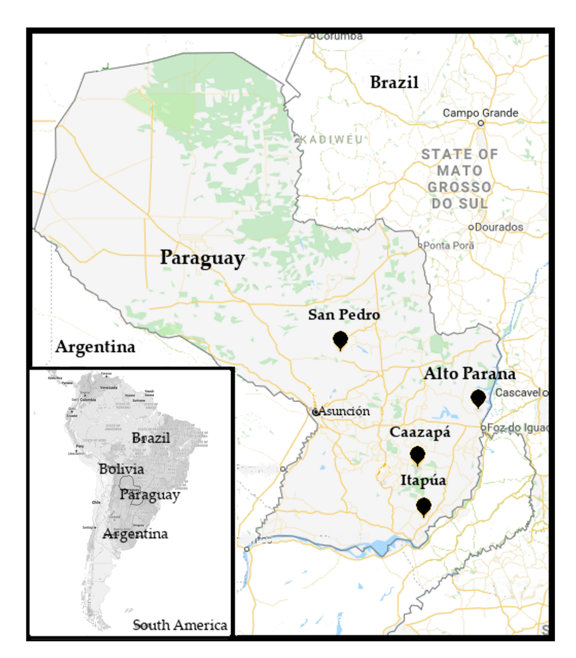
Figure 1. Map of Paraguay showing the geographical locations of San Pedro, Alto Parana, Caazapa and Itapua from which eucalypts samples were collected. Map obtained from Google maps (Google, Mountain View, CA, USA).