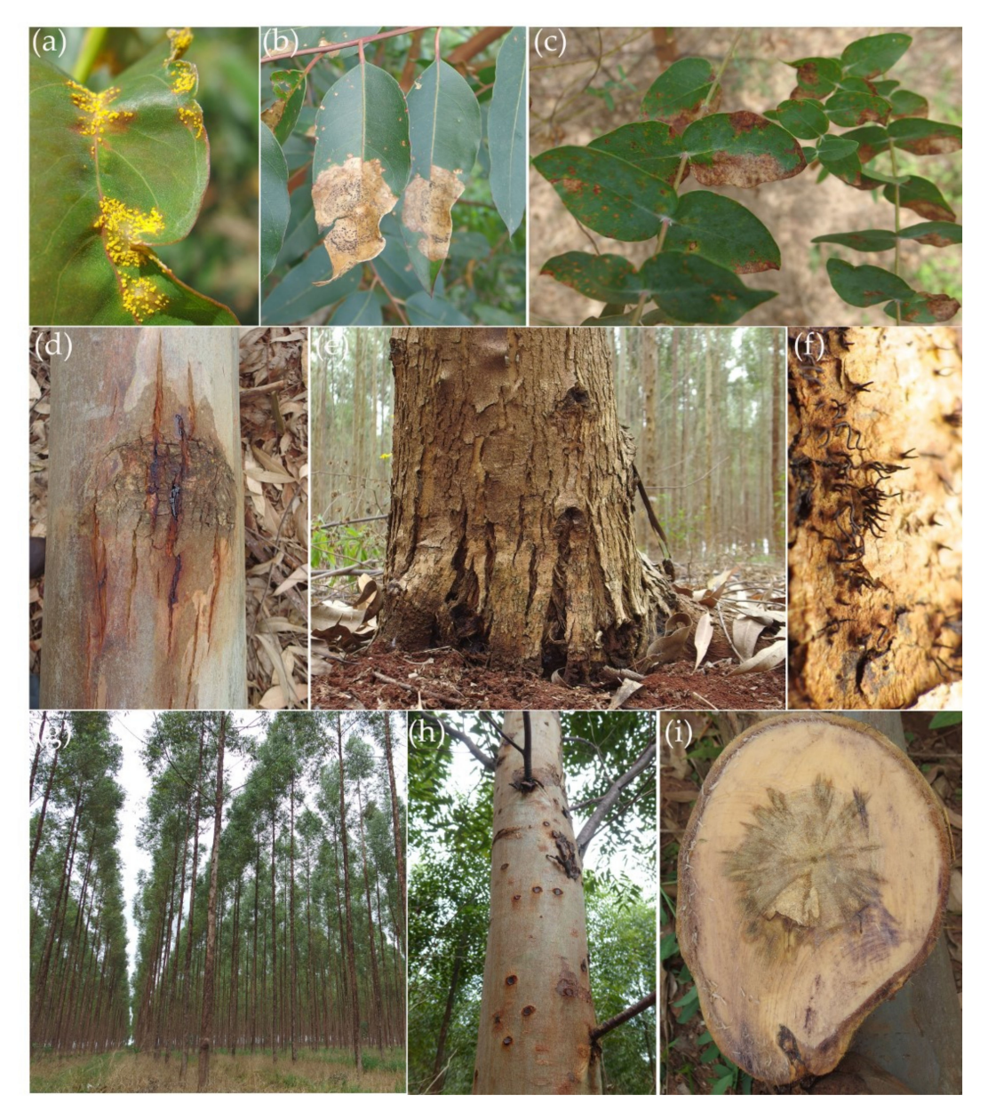
Figure 2. Symptoms of fungal diseases in Paraguayan eucalypts plantations. (a) Myrtle/Eucalypt rust symptoms on mature leaf, (b) Coniella leaf spot, (c) Calonectria blight, (d) Botryosphaeria canker, (e) Chrysoporthe canker, (f) Chrysoporthe sp. on eucalypt bark, (g, h) Teratosphaeria stem canker, (i) cross section showing a stem disease caused by unknown pathogen present in Eucalyptus urophylla x grandis .

parts. This disease was encountered on Eucalyptus grandis , E. urophylla × grandis , and E. benthamii Maiden & Cambage in Caazapa (Table 1). Leaf spots with pycnidia distributed in concentric rings, typical of Coniella leaf spot (Figure 2b), were observed on E. grandis and E. benthamii in Caazapa; however, the causal agent could not be isolated. Leaf blotch lesions coalescing on mature leaves, consistent with Calonectria leaf blotch symptoms (Figure 2c), were found on E. benthamii in Caazapa (Table 1). Leaf spots delimited by leaf veins and pycnidia on the underside of leaves, consistent with Mycosphaerella leaf spot, were found on Eucalyptus urophylla × grandis in nurseries in Alto Parana and Caazapa, on E. urophylla × camaldulensis and E. grandis in nurseries at Caazapa and on adult leaves of E. grandis , E. urophylla × grandis and E. grandis × camaldulensis in San Pedro (Table 1).