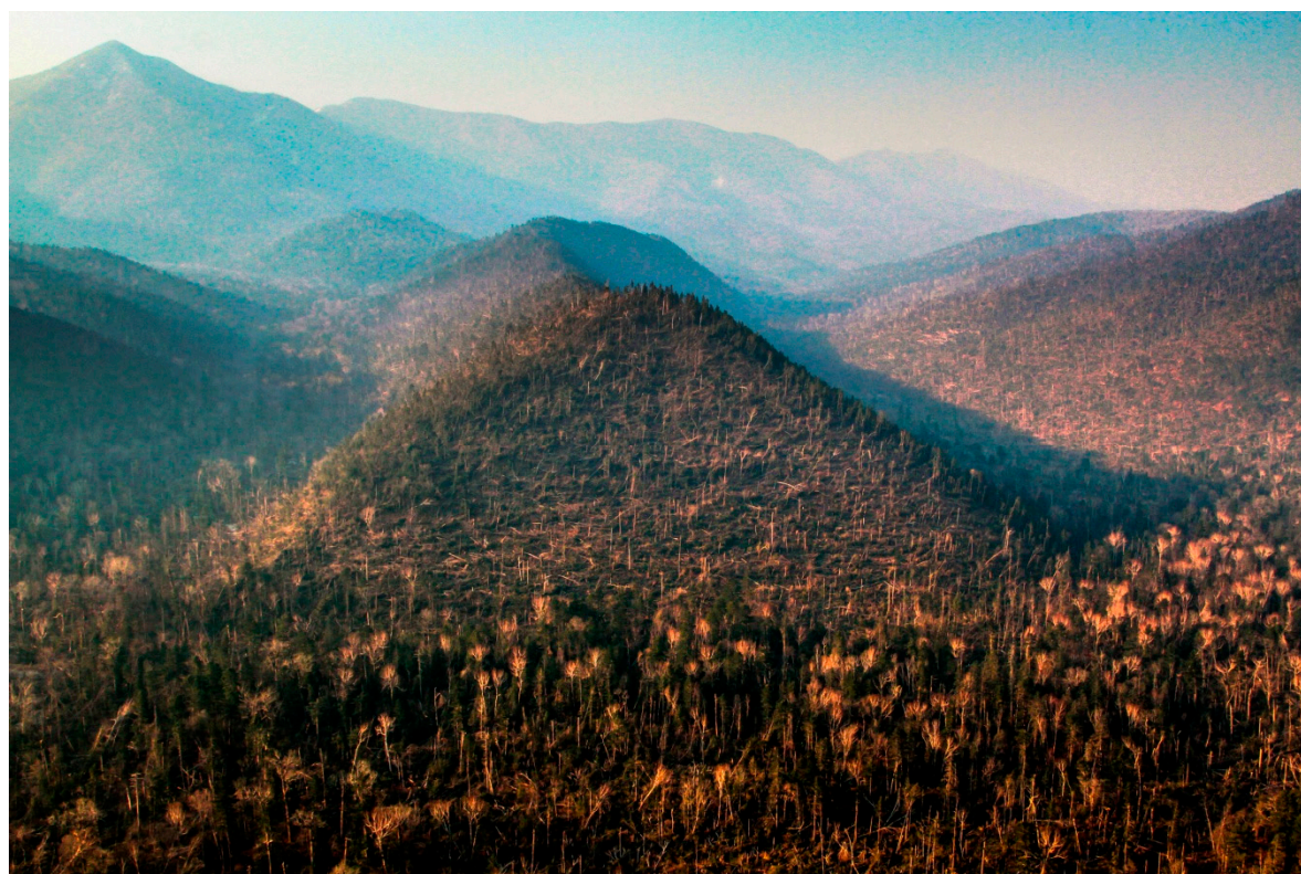
Figure S1. Windthrow forest in the Middle Sikhote-Alin Mountain Range, Russian Far East.