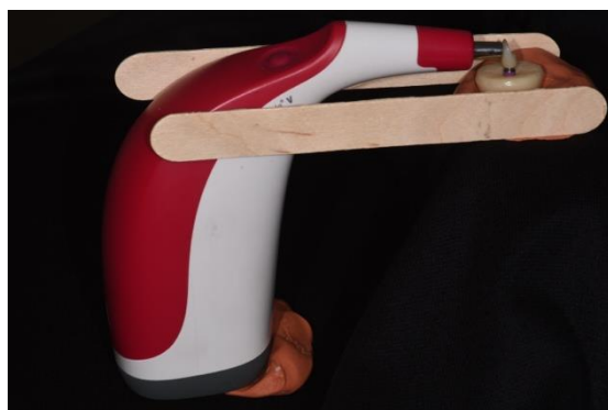
Figure 2. Implant analog embedded into acrylic resin with a screw-retained zirconia crown using ti-base abutment, and spectrophotometric testing was performed using a special mold to hold the device while touching the crown.

One hundred and sixty CAD-CAM ti-base abutments with two heights of 3.5 and 5.5-mm (RC Variobase; Straumann) were screwed to resin-embedded implant analogs (RC implant analog; Straumann) (Figure 2).