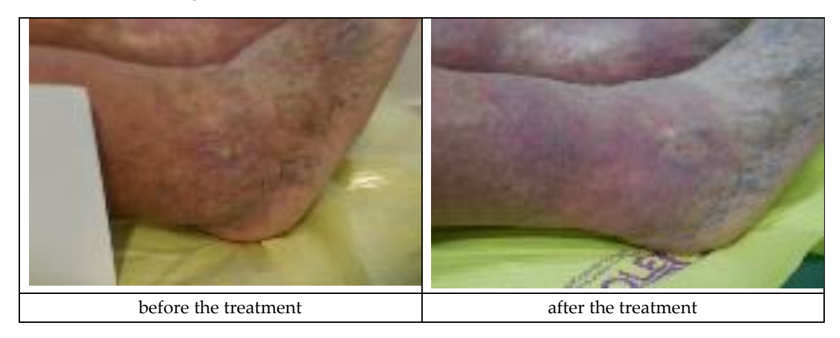
Figure 6. Wound treatment with Medisorb P Plus (Patient 3).

The Medisorb R Membrane was also applied in a patient who suffered from left crus ulceration and had the following comorbidities: hypertension, pericardial fluid (of unknown etiology), and who has suffered from a stroke (Patient 4). During the therapy, a number of deviations were observed, which were not connected with the use of the dressings (increased amount of leukocytes and erythrocytes in urine, increased leukocytes and thrombocytes in blood, and a positive test for faecal occult blood). At the moment of inclusion in the trial, the surface of the venous ulceration was equal to 10 cm<sup>2</sup> and its depth was equal to 3 mm (ulceration involved full thickness of the skin with visible subcutaneous tissue, moderate inflammation and exudate, visible telangiectasia and varicose veins, and oedema of the lower leg, with the wound defined as being at the Knighton II/III stage). During the final visit at the 180th day of the therapy, the skin wound penetrated only the epidermis and was transformed to a small, superficial skin erosion of a 0.5-cm<sup>2</sup> surface (moderate exudation, no inflammation, visible telangiectasia, and oedema). The applied treatment caused a significant clinical improvement of the wound. Figure 7 presents the wound during the first visit and the last visit.