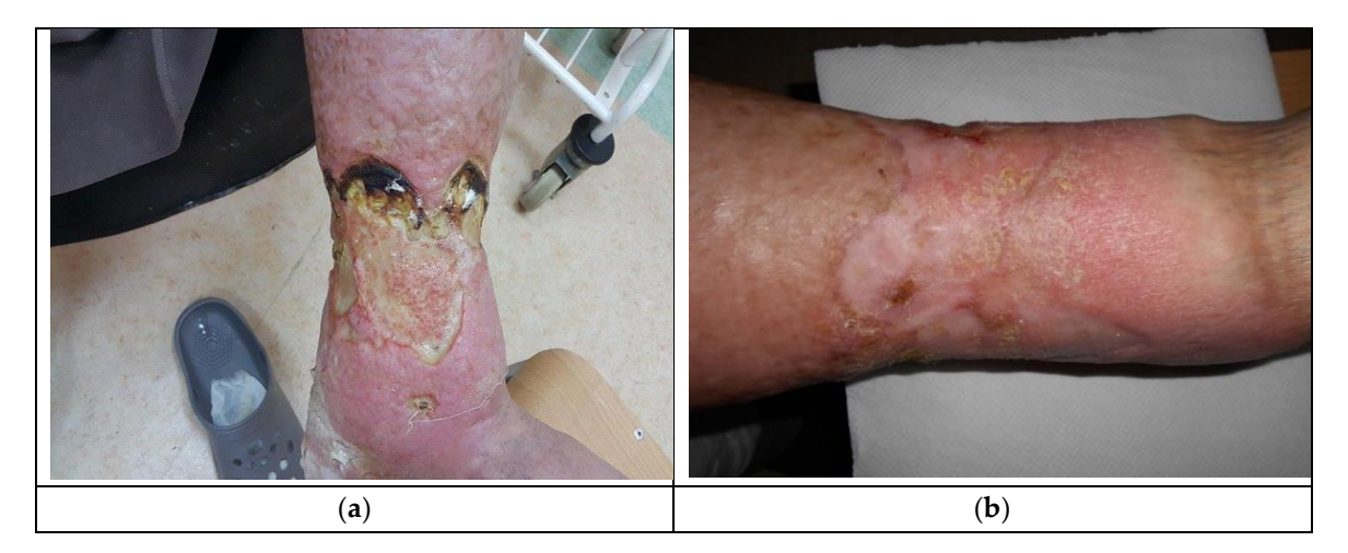
Figure 3. The wound treatment with Medisorb R Ag (Patient 1): ( a ) before the treatment and ( b ) after the treatment.

Patient 2, who had Medisorb R Ag applied, suffered from right crus ulceration resulting from venous insufficiency for a few years. The wound was classified as stage III according to Knighton. After two months, the patient also had gastroesophageal reflux disease. The result of the treatment was total healing of the wound (surface 5.74 cm<sup>2</sup> and 3 mm in depth). It was stated that the wound was infected with Staphylococcus aureus and that, during the fourth visit, the wound swab culture was negative. Figure 4a shows the wound before the therapy and Figure 4b presents the wound during the last visit.