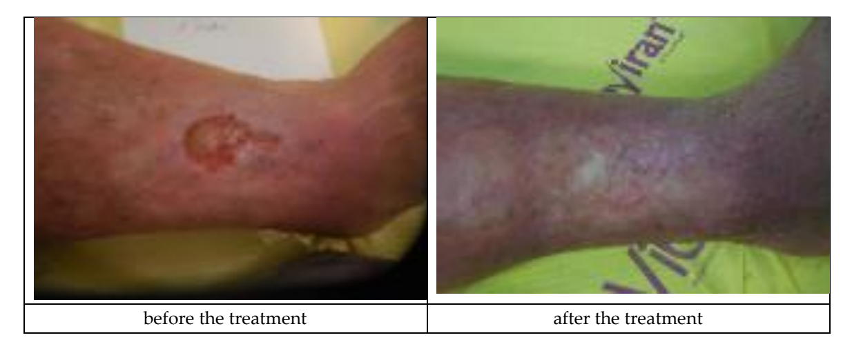
Figure 5. Wound treatment with Medisorb R Membrane (Patient 3).

no characteristics of inflammation). Figures 5 and 6 present the wounds treated with Medisorb R Membrane and Medisorb P Plus before the therapy and at the final visit.