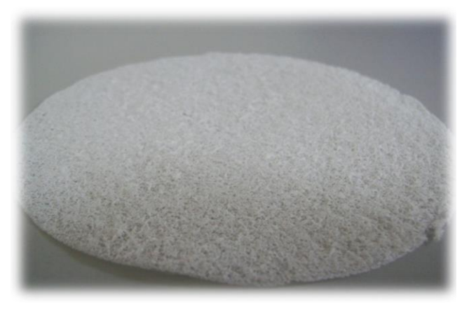
Figure 1. Medisorb R Membrane/Medisorb R Ag dressing.