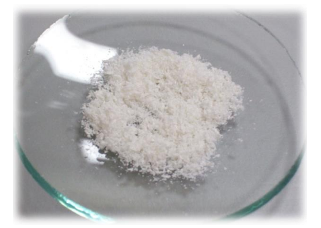
Figure 2. Medisorb R Powder dressing.

The 90:10 butyric-acetic chitin copolyester (BAC 90:10) was obtained with the method using a mixture of acetic and butyric acid anhydrides in the presence of perchloric acid as a catalyst [42,43]. BAC 90:10 was a raw material for obtaining highly porous dressings. Two methods of manufacturing were developed [44]: (a) pouring BAC 90:10 solution in ethanol on a layer of solid porophor, which was later leached, and (b) using the suspension of porophor in BAC 90:10 solution, however, this method was required using a mixture of solvents of bulk density similar to the one of the used porophor.