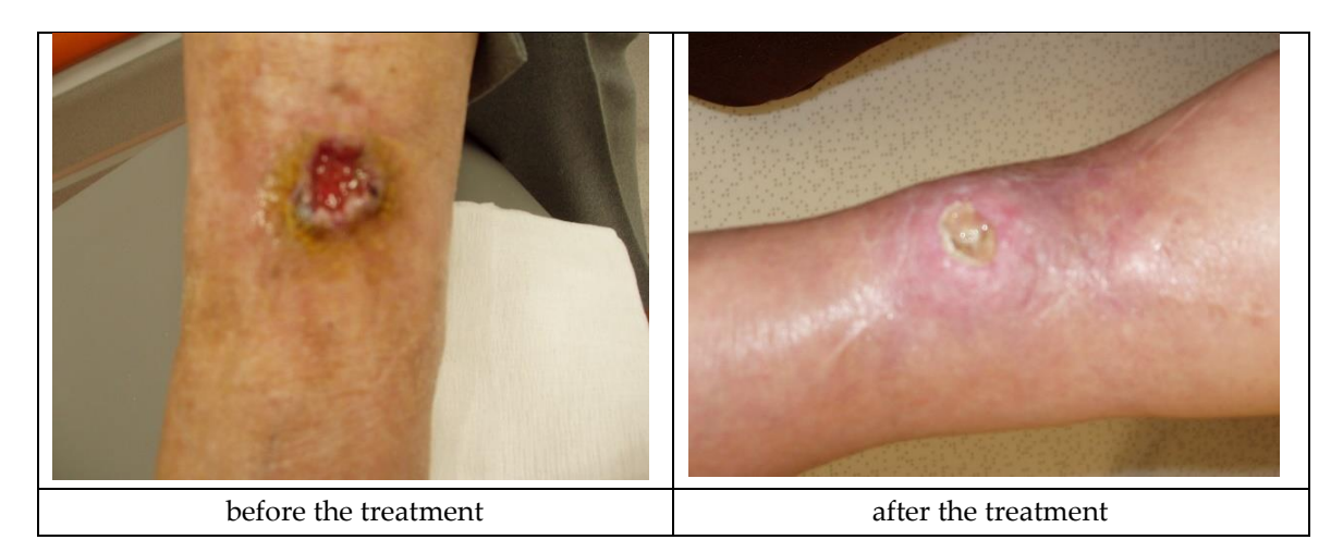
Figure 8. Wound treatment with Medisorb R Powder and Medisorb R Membrane (Patient 5).

Medisorb R Powder was applied in a patient with a slightly bleeding, round wound. The wound's diameter was approximately 3 cm and its depth was 0.8 mm on the left crus (Patient 5). Additionally, as secondary dressing, the Medisorb R Membrane was applied. The wound was a penetrating wound into the subcutaneous tissue and fascia, exuding serous and blood secretions, which did not respond to using standard dressings. In Knighton's 6-stage classification, the wound could have been described as grade III. During the therapy, the growth of granulation was observed going from the edge of the oval wound. The wound itself had a 0.8-cm deep crater-like shape. At the end of treatment (after 3 months), the wound was shallower—0.3 cm in depth. During the treatment, the depth of the wound had a significant influence on hindering the healing process in the wound's central part, which was covered in a necrotic tissue scab. During the last visit, the Patient made a decision of terminating treatment stating that they will take care of the wound on their own. This case made it possible to positively evaluate the action of Medisorb R Powder, which had a bactericidal activity on bacterial flora, stimulated the granulation, and also limited the exudation from the wound. The action of Medisorb R Powder and Medisorb R Membrane can, thus, be evaluated positively. Figure 8 presents the wound before therapy and its state during the final visit.