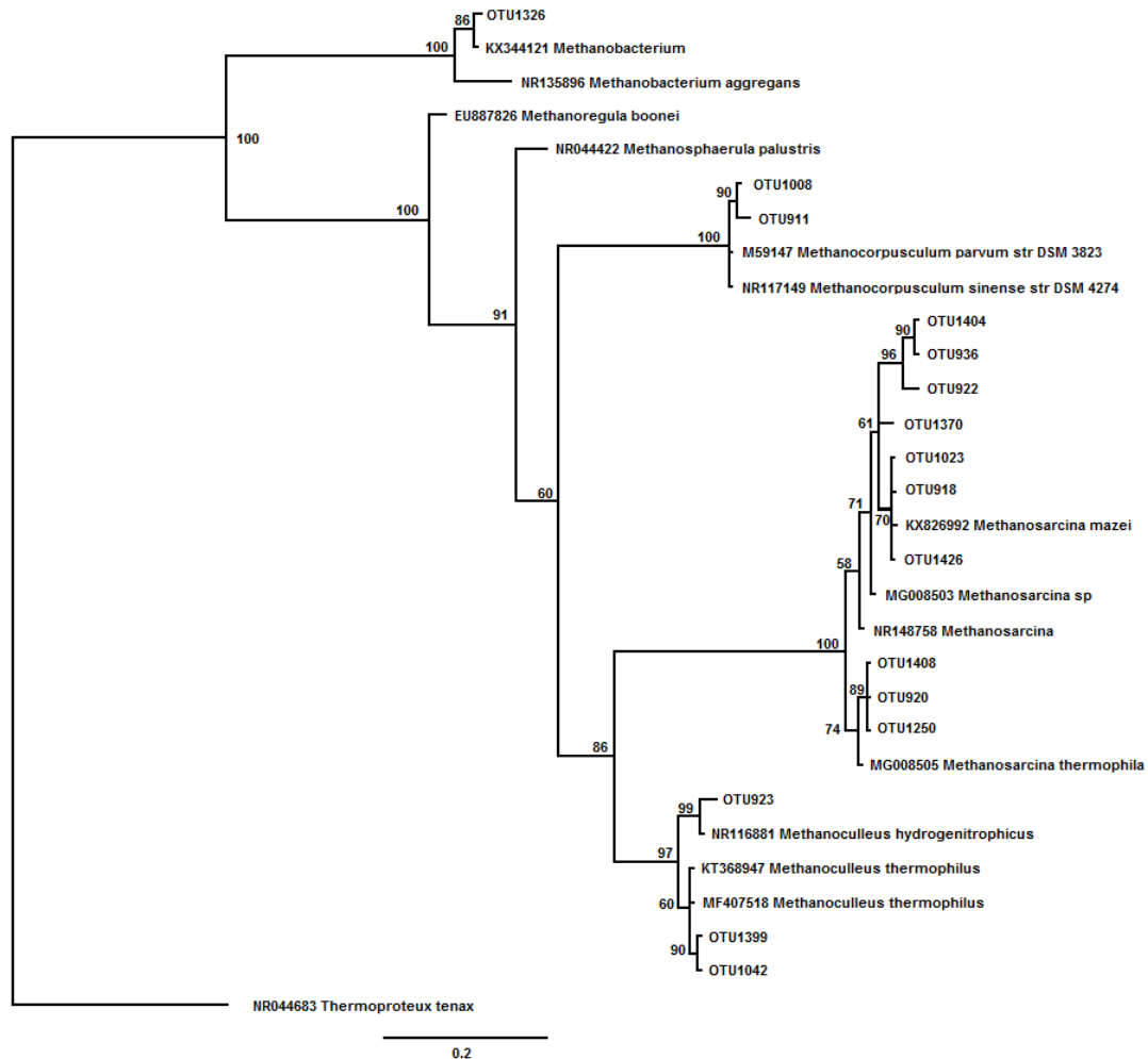
SM-Figure S2. Bayesian tree based on 16S rRNA gene sequences showing the position of OTU classified as Euryarchaeota. Bootstrap values based on 10,000,000 replications are shown at branch nodes. Thermoproteus tenax was used as outgroup. Bar shows 0.06 substitutions per nucleotide.