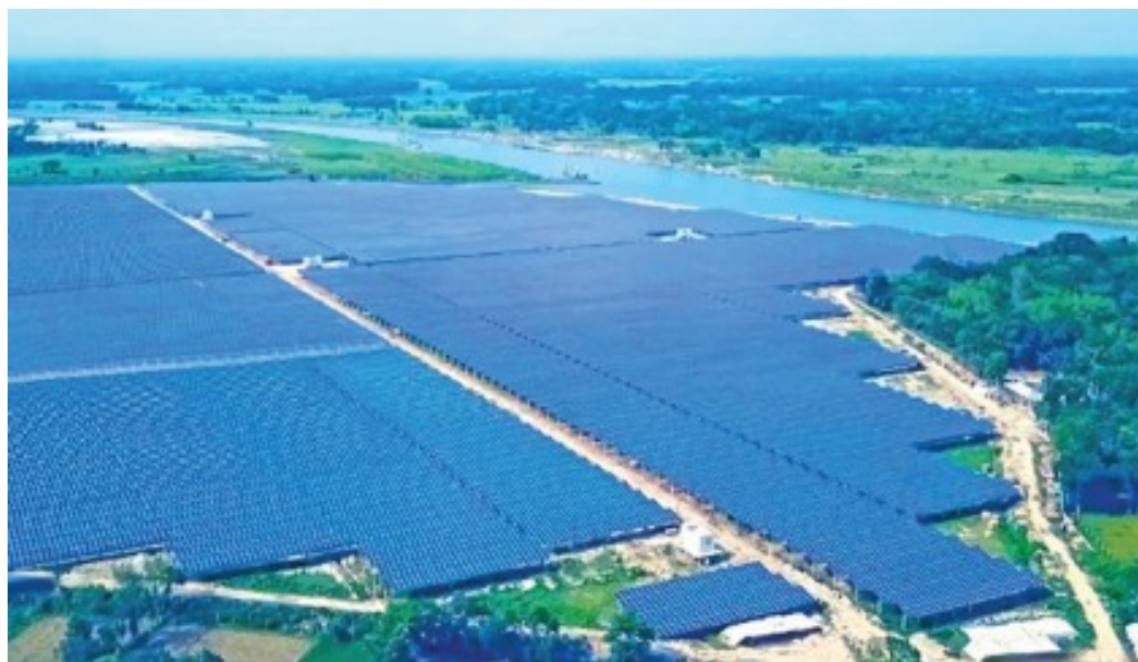
Figure S2. Gauripur solar park, Mymensingh, Bangladesh [73].