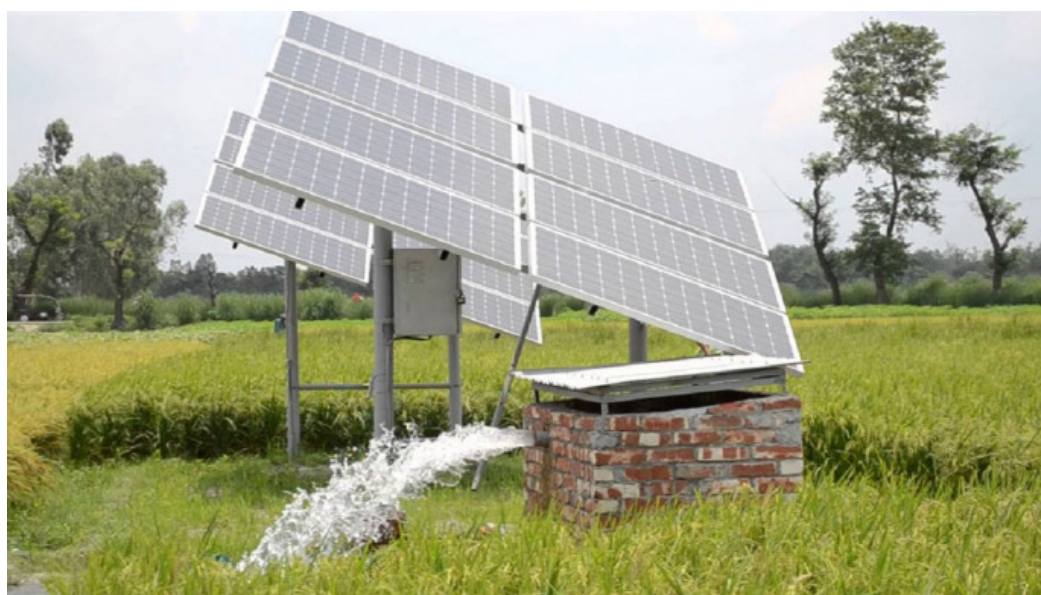
Figure S3. Solar irrigation project in Bangladesh [80].