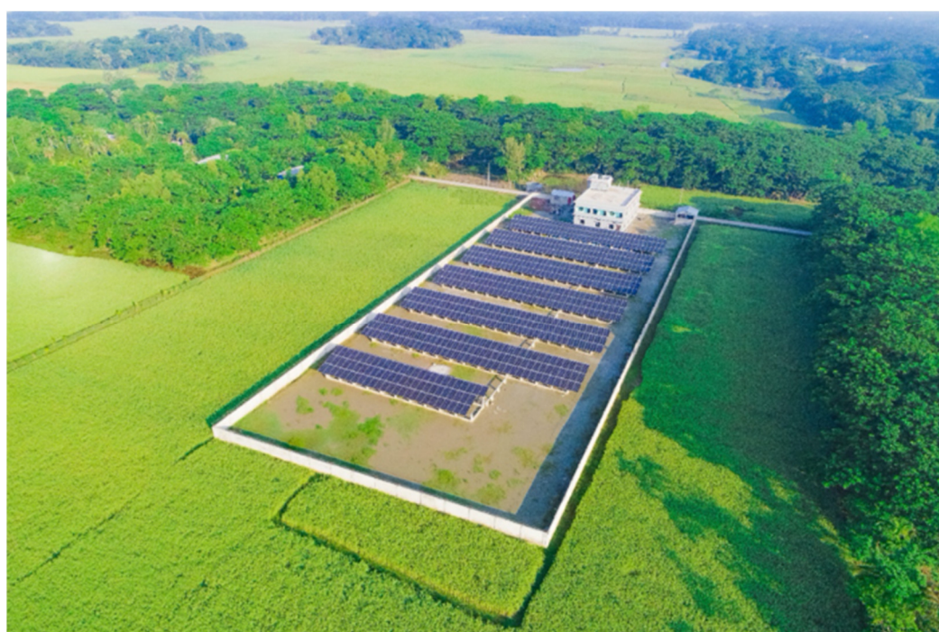
Figure S4. Solar mini-grid in Monpura island of Bangladesh [83].