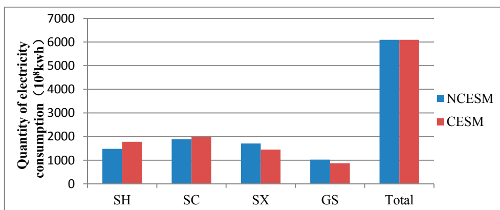
Figure 1. Comparison of quantity of electricity consumption under the two models.