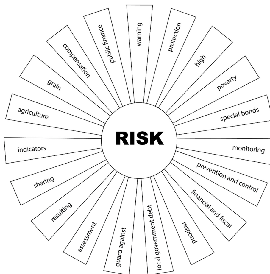
Figure 3. The network of the form “risk” of China Central and Local Government.

Unlike the People’s Bank of China study, the term risk is not systematically present at the general level but at the local government level. The environment in which they operate is considered more unstable, hence the need to sound the alarm on the level of risk ( warning, high ) while preserving the central government ( guard against, protection ). Still, this context of uncertainty is, above all, the opportunity to assert the management capacities of the central government against the risks ( local government debt, public finance, grain, agriculture, special bonds . . . ) by ( monitoring, assessment, compensation, sharing, prevention, and control, respond . . . ). We are in a pure hierarchy where the top controls and ensures the survival of the whole group.