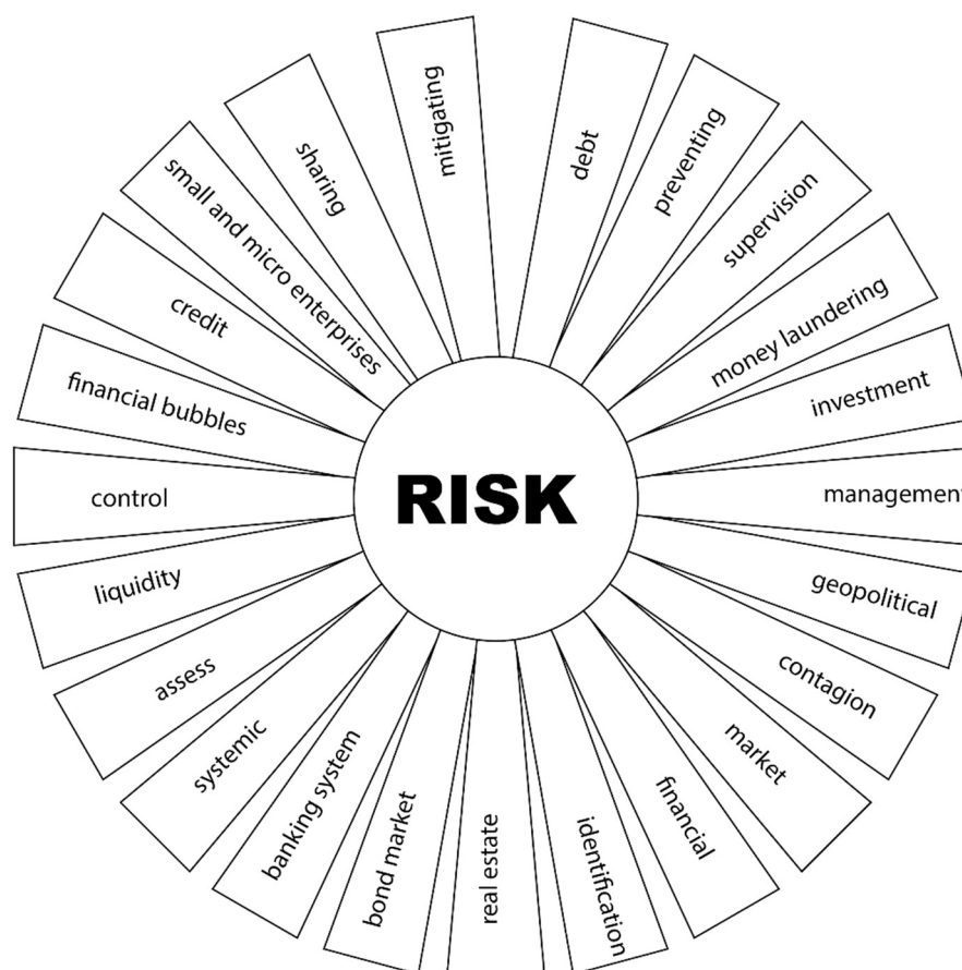
Figure 2. The network of the form “risk” of People’s Bank of China.

The analysis of the annual reports of the People’s Bank of China 2011 to 2019 shows a significant presence of the word “risk” in the financial communication practiced. More precisely, let us see how Figure 2 shows the proximities of words around the term “risk”.