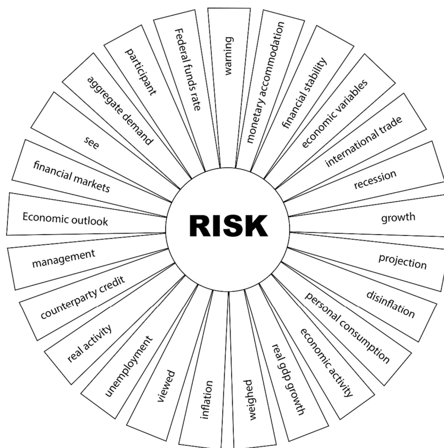
Figure 4. The network of the form “risk” of the U.S. Federal Reserve.

Here we have an explicit delimitation of the responsibilities represented by (participants). We also find the vocabulary testifying to a particular aversion to risk (viewed, see, weighed), reinforced by the technical terminology of risk management (management) attributable to control internal and prudential regulations. In this sense, a context emerges that can be considered unstable (inflation, disinflation, recession) and its consequences (unemployment, economic activity, personal consumption, real activity ...). It describes the reality of risk management. This imaginary threat and the construction of one’s knowledge resources are characteristic of “egalitarian sectarianism” in cultural perceptions of risk. It is as if the notion of risk has spread everywhere or as if risk management is no longer the risk department’s prerogative. The explanation here is familiar to most world economies’ in their general state, with countries trying to adapt to new economic regulations (i.e., Basel 3) in a continually changing financial world.