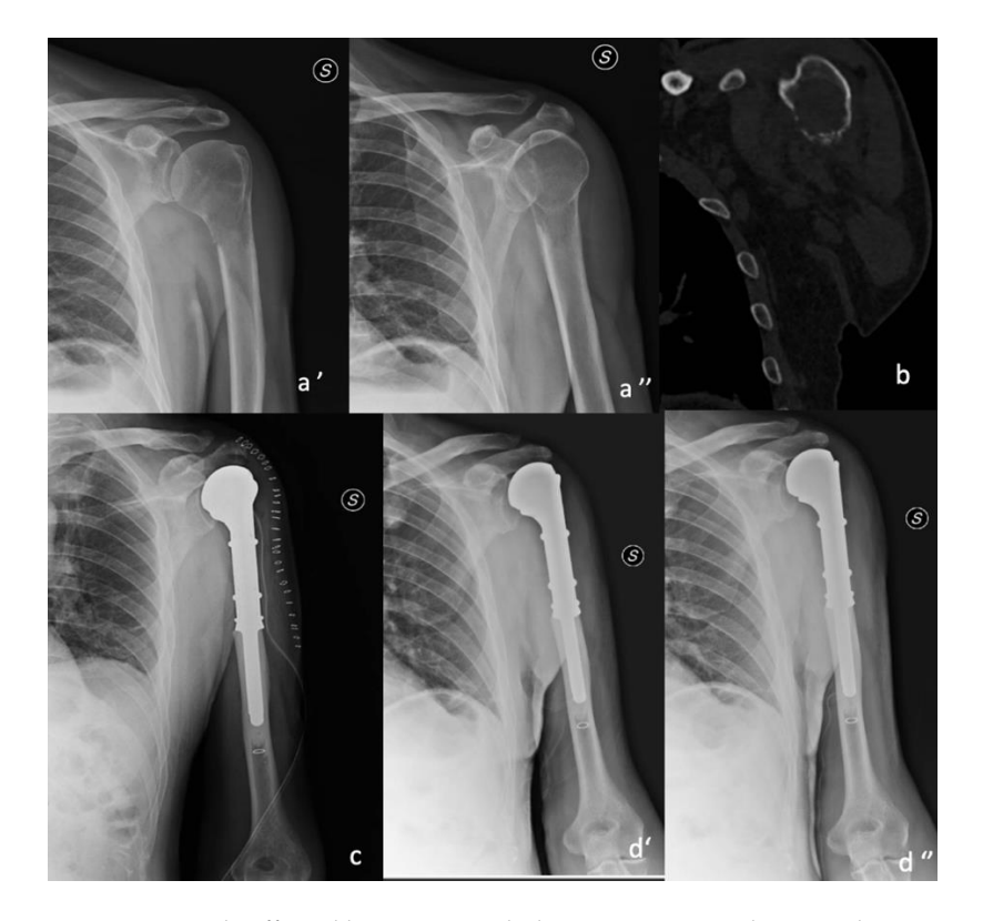
Figure 1. y.o. male affected by metastatic kidney tumor. Lateral approach resection was 10 cm. ( a ', a ") pre-op X-ray; ( b ) pre-op ct scan; ( c ) post-op X-ray; ( d ', d ") 6 months follow.

Each surgery was performed after general anesthesia in the beach-chair position. Preoperatively, antibiotic prophylaxis was administered using Cephazoline 2 g i.v. when not contraindicated. A urinary catheter was placed in all patients and removed 24–48 h after surgery. A resection surgery of the proximal humerus was performed, assessing preoperative imaging and in accordance with Enneking's resection criteria [17], and followed by replacement with silver-coated modular endoprosthesis. Minimum resection performed was 10 cm, considering the size of the smallest module of prosthesis used. In all cases, Trevira tube was used to anchor the sectioned tendons and soft tissues to increase prosthesis stability, as manufacturer's instructions. All shoulder replacement procedures were performed by the same orthopedic surgeon, experienced in orthopedic oncological surgery. Two different surgical approaches were performed, basically according to the localization of the metastases and to the level of resection; hence, the deltopectoral is an extendable surgical approach useful for bigger lesions. In 10 cases, a deltopectoral approach was used, while in 10 a lateral approach was used. The deltoid muscle and the rotator cuff tendons were preserved only if untouched by cancer or via preoperative imaging [Figure 1].