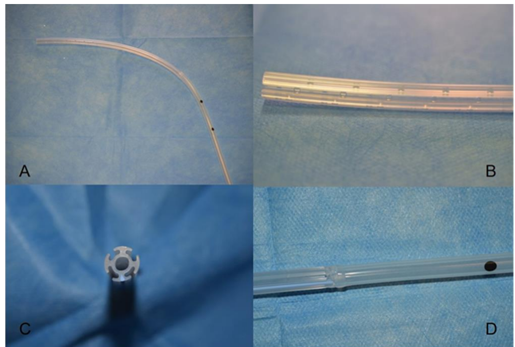
Figure 1. Smart Drain Coaxial tube (A). These tubes consist of four external fluted channels for fluids drainage and an internal section which allows separate air evacuation from appropriate distal bores (B–D).

In this regard, the aim of this study is to compare the use of two standard tubes (STs) with one SDC after thoracotomy for pulmonary lobectomy. The primary endpoint aims at verifying the efficacy of SDC in terms of fluid and air drainage evaluating the daily quantity of fluids collected and the presence of postoperative pneumothorax or pleural effusion at radiological imaging; the secondary endpoint was to assess incidence of complications after chest tubes removal, postoperative pain, hospital stay and costs compared to STs. We present the following article in accordance with the CONSORT reporting checklist.