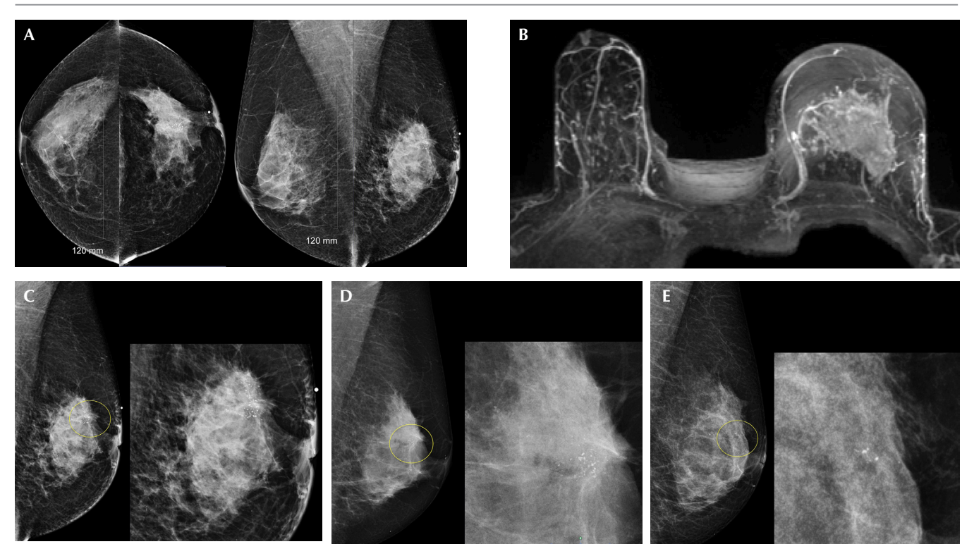
FIGURE 2 Locally advanced breast cancer in a 56-year-old woman, with calcifications seen at the same site 5 years earlier, likely an evolution from ductal carcinoma in situ (DCIS). (A) Bilateral digital mammograms demonstrate heterogeneously dense breasts (American College of Radiology, BI-RADS C), with a large spiculated mass in the central left breast causing left nipple retraction corresponding to the palpable mass. An ultrasound-guided breast biopsy (not shown) confirmed invasive ductal carcinoma, with axillary node metastases. (B) Maximal-intensity projection image from magnetic resonance imaging shows tumour occupying most of the left breast, measuring more than 5 cm. (C) Photographic enlargement of the left breast from a screening mammogram 2 years earlier shows a smaller cluster of calcifications within the same area, not detected at screening. (E) Photographic enlargement of the left breast from a screening mammogram 5 years earlier shows a very small group of fine pleomorphic calcifications, likely DCIS, identified only in retrospect.

Does detecting DCIS reduce the rate of invasive cancer? Currently, no tools are available to predict which DCIS will progress and which will not. In the United Kingdom, Duffy et al.<sup>50</sup> conducted a retrospective population-based study that set out to estimate the association between detection of DCIS at screening and the incidence of subsequent invasive interval всаз. Data were obtained for 5.2 million women 50-64 years of age who attended mammographic breast screening through the National Health Service during 2003–2007. Interval cancers diagnosed symptomatically within 36 months after the relevant screen were recorded. The average detection frequency of DCIS was 1.6 per 1000 women screened. A significant negative association was observed for screen-detected DCIS and the rate of invasive interval cancers; for every 3 screen-detected cases of DCIS, 1 fewer invasive interval cancer occurred in the subsequent 3 years. The study concluded that detection and treatment of DCIS was worthwhile for the prevention of future invasive disease. To mitigate the harm of overdiagnosis, women should be involved in the decision-making for DCIS treatment, based on information about the risks of treatment compared with watchful waiting.