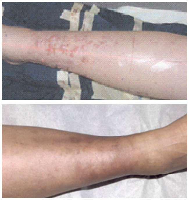
FIGURE 2 Radiation treatment of cutaneous myelomatous lesions. On the top, the myelomatous lesions before radiation treatment. On the bottom, the patient's leg 1 month after completing treatment.

Unfortunately, the lesions recurred at cutaneous sites not included in the initial radiation field, including the right foot, left ankle, right breast, left orbit,