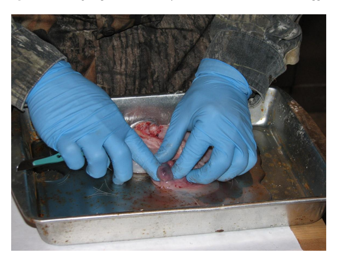
Figure 1. Counting corpora lutea in ovary from white-tailed deer in Mississippi.

Figure 2. Conception date is determined from fetus length of white-tailed deer in Mississippi.