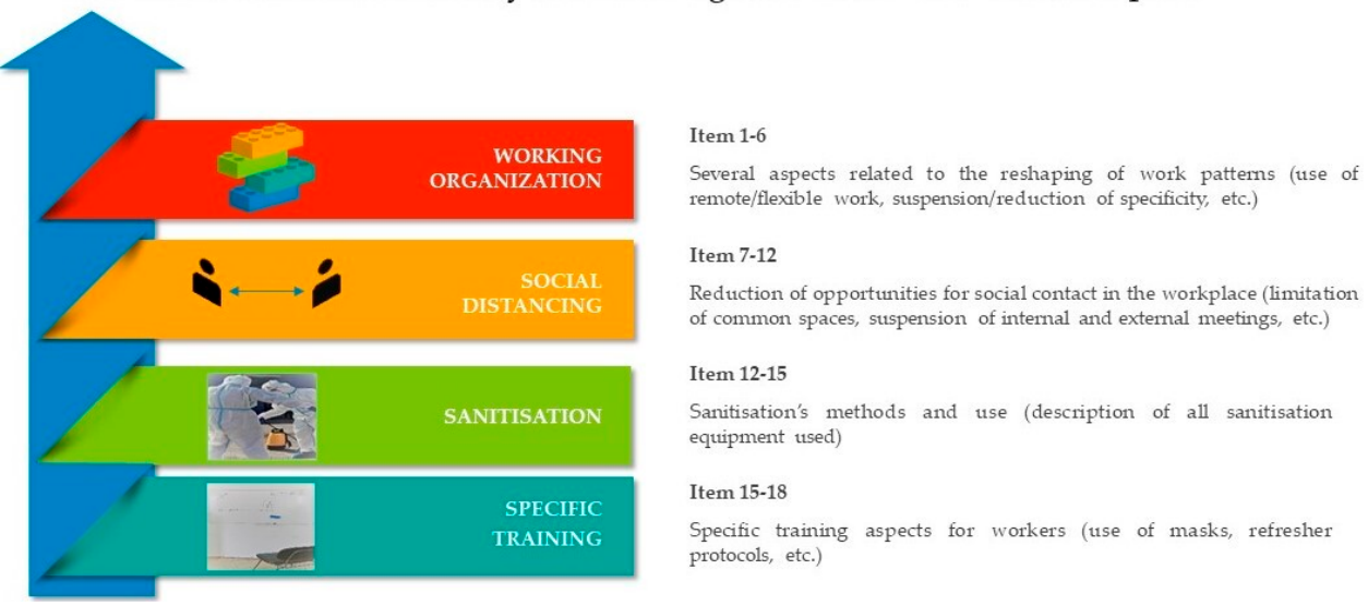
Figure 1. Representation of the four macro-items synthesis from the Italian Regulatory Shared Protocol.

Each item involves a closed question with three possible answers ('YES'; 'NO'; 'Not applicable') and a note field for details. The survey was conducted by e-mail, giving companies a seven-day deadline to respond.