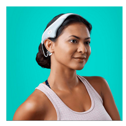
Figure 2. Modius Stress device.

Subjects should open the study app (VESTAL) prior to each VeNS stimulation session. Subjects will put on the VeNS headset (see Figure 2) and apply two self-adhesive electrode pads on the mastoid process behind the ear. Subjects should remain in a sitting down and resting position throughout the stimulation period. Subjects will then turn on the device which will then deliver a small electrical impulse (range from 0 mA to max. 1.5 mA, level 0–10) at 100 Hz. Subjects can adjust the device output until they are aware of a comfortable tingling sensation in the skin. The VeNS will then deliver the stimulation for 30 min and will automatically turn off. The level of stimulation is determined by a gentle swaying indicating modulation of the vestibular nerve. Subjects will be able to check their activities on the study app and modify the stimulation level either via the mobile app or via the iPods. The device can be paused/stopped by pressing the power button twice on the headset or via the study app. Subjects will hear a single beep sound whenever they change the stimulation level. After the stimulation, subjects can remove the headset and dispose the electrode pads.