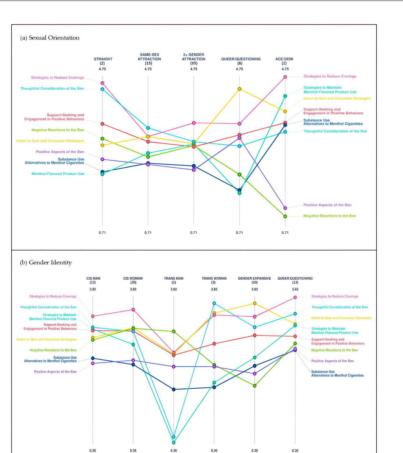
Figure 3. ( a , b ) Pattern-matching results comparing cluster rating averages for multi-level SGM variables: ( a ) sexual orientation; ( b ) gender identity. Numbers in parentheses represent subgroup sample sizes.