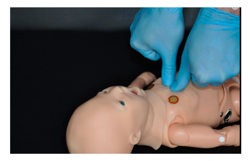
Figure 1. Smereka chest-compression method [6].

To execute the chest compressions, each participant was allowed to choose the compression method with which they believed that they compressed more efficiently. The options provided were the Smereka method [6] (Figure 1) and the two-thumb encircling hands technique [7] (Figure 2), the same that were provided during practical training.