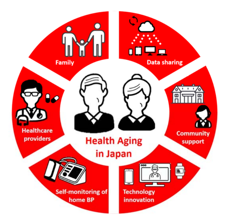
Figure 1. Patient-centered management of hypertension in older people using digital healthcare solutions in Japan.

The table (Table 1) summarizes the advantages and disadvantages of using BP telemonitoring systems for the management of hypertension in older people [13]. To date, BP telemonitoring has mostly been used in clinical trials and has not yet been widely used in clinical practice. This section discusses the benefits of medical telemonitoring systems for the management of hypertension in older people and the current barriers to its widespread use in Japan.