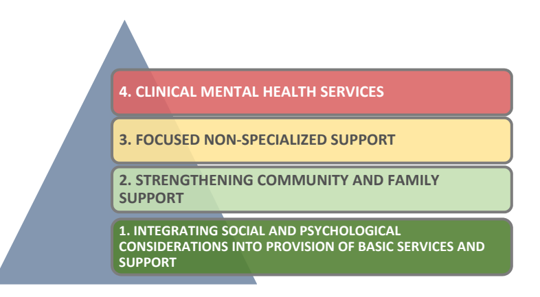
Figure 1. Multi-layered MHPSS services and supports (2021, [19] p. 3).