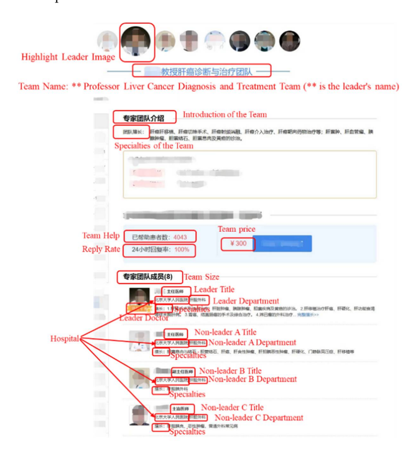
Figure 2. Homepage of online doctor team.