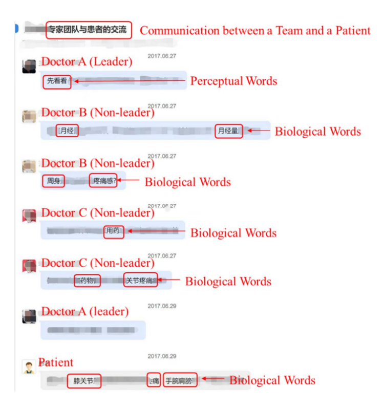
Figure 3. Doctor-patient communication page with patients (incomplete screenshot).