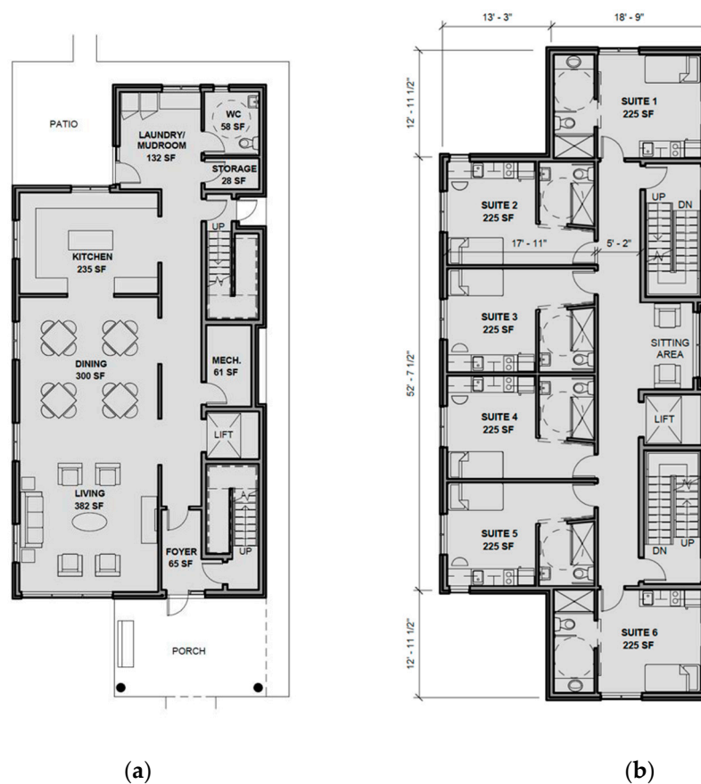
Figure 1. Bridge Healing facility floorplan with consideration of The Eden Alternative™. (a) First floor. (b) Second floor.

To promote physical activity and engagement, each housing facility's outdoor area contains a gardening space available for use by residents. Communal gardening areas have been used successfully in other facilities adopting The Eden Alternative™ to introduce novelty, reduce helplessness, and improve residents' physical condition [20].