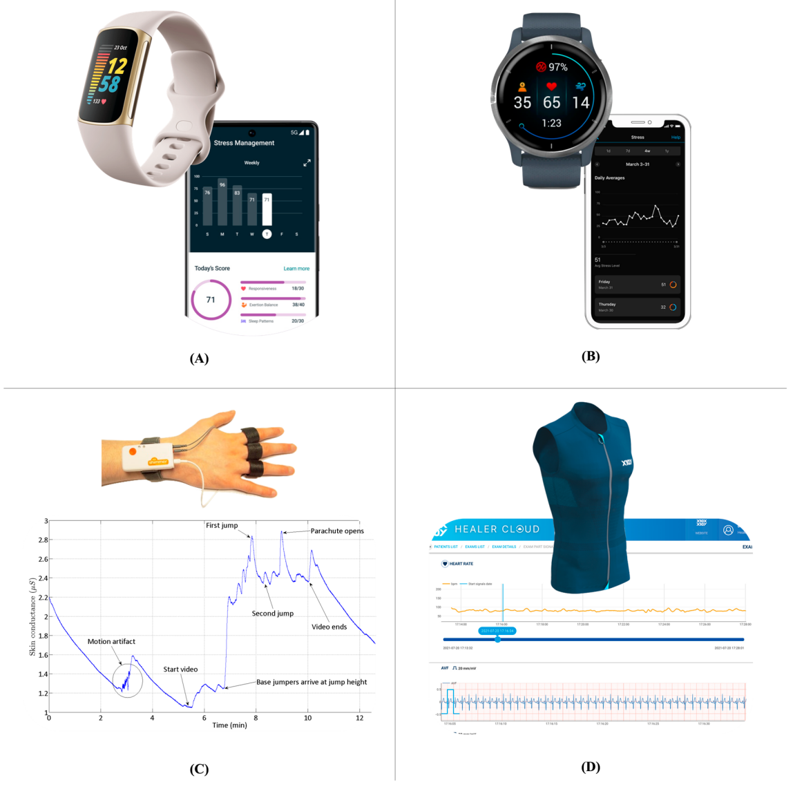
Figure 2. ( A ) Fitbit Change 5 wristband; ( B ) Garmin Venu 2 smart watch; ( C ) Shimmer3 GSR+ unit; ( D ) L.I.F.E. Italia Healer R2 smart garment.

Therefore, various types of wearable devices are currently used and developed for health-monitoring and many of these can be used for some type of stress level assessment, responding to existing limitations connected to traditional approaches to the measurement of stress.