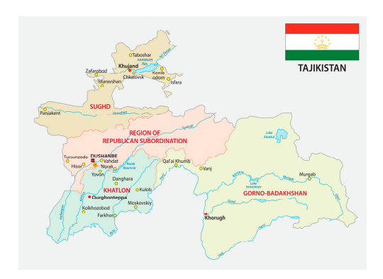
Figure 1. Map of Tajikistan.

Area of residence in Tajikistan (see Figure 1) was assessed by asking participants to select from a list the area of Tajikistan in which they had resided before migrating to Moscow. The list contained Tajikistan's 4 administrative regions (the provinces of Khatlon, Sughd, and Gorno-Badakhshan Autonomous Oblast (GBAO), and the Districts of Republican Subordination—in Russian referred to as Rayoni Respublicanskogo Podchinenie (RRP)), and Dushanbe (Tajikistan's capital city).