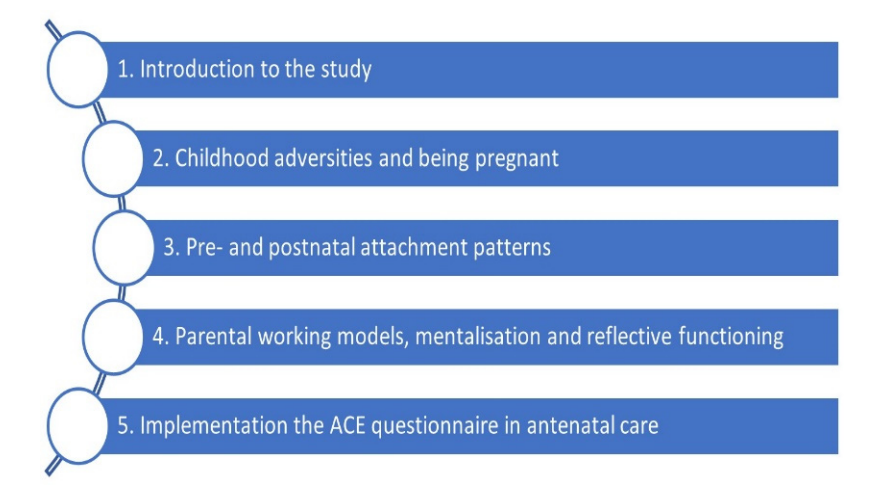
Figure 1. Training course themes.

Prior to the implementation of ACE in midwifery practice, fifty midwives providing antenatal care at the three hospitals' maternity care wards received a one-day training course. A total of five training courses were held. To ensure access to training for all midwives, an online version of the course was offered to midwives who were unable to participate in the scheduled courses (number not recorded). Author V.d.L. facilitated both course types, which built on attachment theory, pedagogical theory, and existing research on childhood adversities. In the figure below, the course themes are presented (Figure 1).