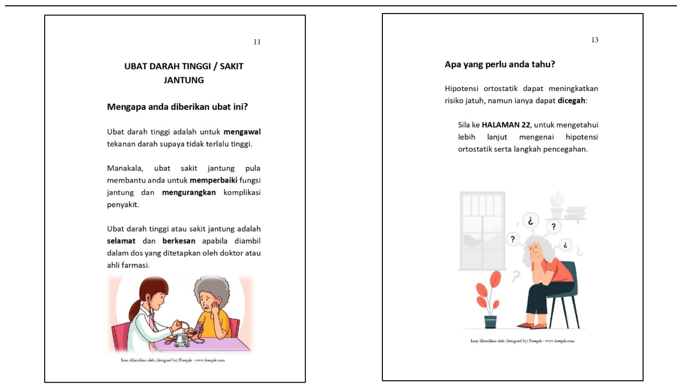
Table A4. Sample pages of the booklet.

a The questionnaire used a Likert-type scale ranging from 1 = strongly disagree to 5 = strongly agree for the answer options.