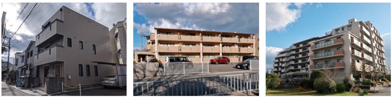
Detached houses of two or three stories

We targeted these three housing types because they were the most common types of residences in Japan, according to the housing and land survey of Japan [34]. There are about 28.82 million detached houses, 38.96 million apartments, and 2.07 million terrace houses. The number of DH<sub>two or three stories</sub> is about 22.9 million, which is 79.5% of the total number of detached houses. Concerning residential apartments, we assumed that households with housemates live in residences with two or more rooms; hence, we analyzed residential apartments with two or more rooms, encompassing rental apartments and condominium apartments. Figure 3 shows common images of each residential type.