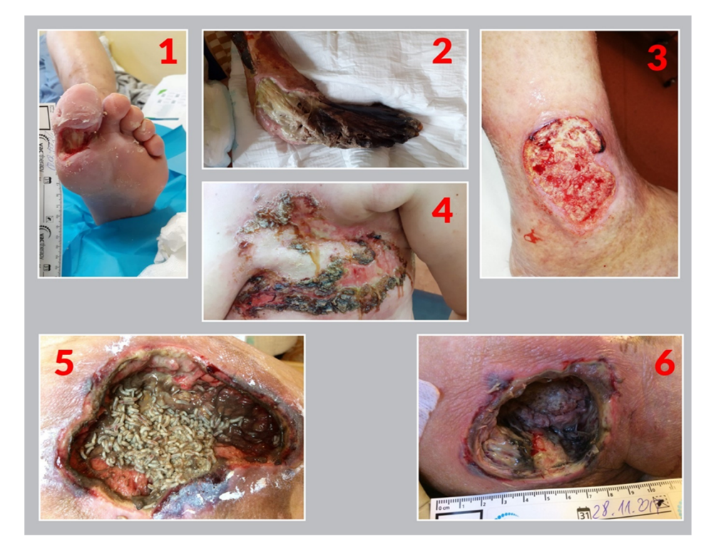
Figure 1. Wounds presented for evaluation by the subjects.

The third part of the research protocol consisted of 6 photos of chronic wounds (Figure 1) of various aetiologies, selected from a prepared bank of 30 photos. The first photo (1) shows a diabetic foot (hallux wound) the wound is debrided and prepared for treatment. The second photo (2) presents a foot necrosis in a geriatric patient at the end of life. The third photo (3) is ulceration of arteriovenous origin located at the lateral side of the ankle. The fourth photo (4) is neoplastic wound at the site of metastasis after left breast amputation. The fifth photo (5) is pressure ulcer, during the third day of MDT with Lucilla sericata larvae. The last sixth photo (6) shows a deep pressure ulcer with black and slushy necrotic tissue located in the area of the ischial tuberosity.