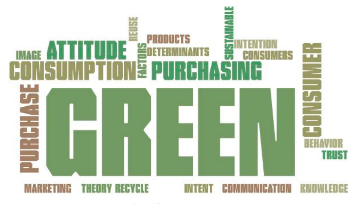
Figure 2. Keywords used for search strategy.

Thirdly, the authors used the inclusion and exclusion criteria reported by [34,35] and they performed a literature analysis through a combination of the following keywords (Figure 2) in several electronic databases such as Web of Science, Science Direct, Springer Link, SAGE, and Emerald Insight.