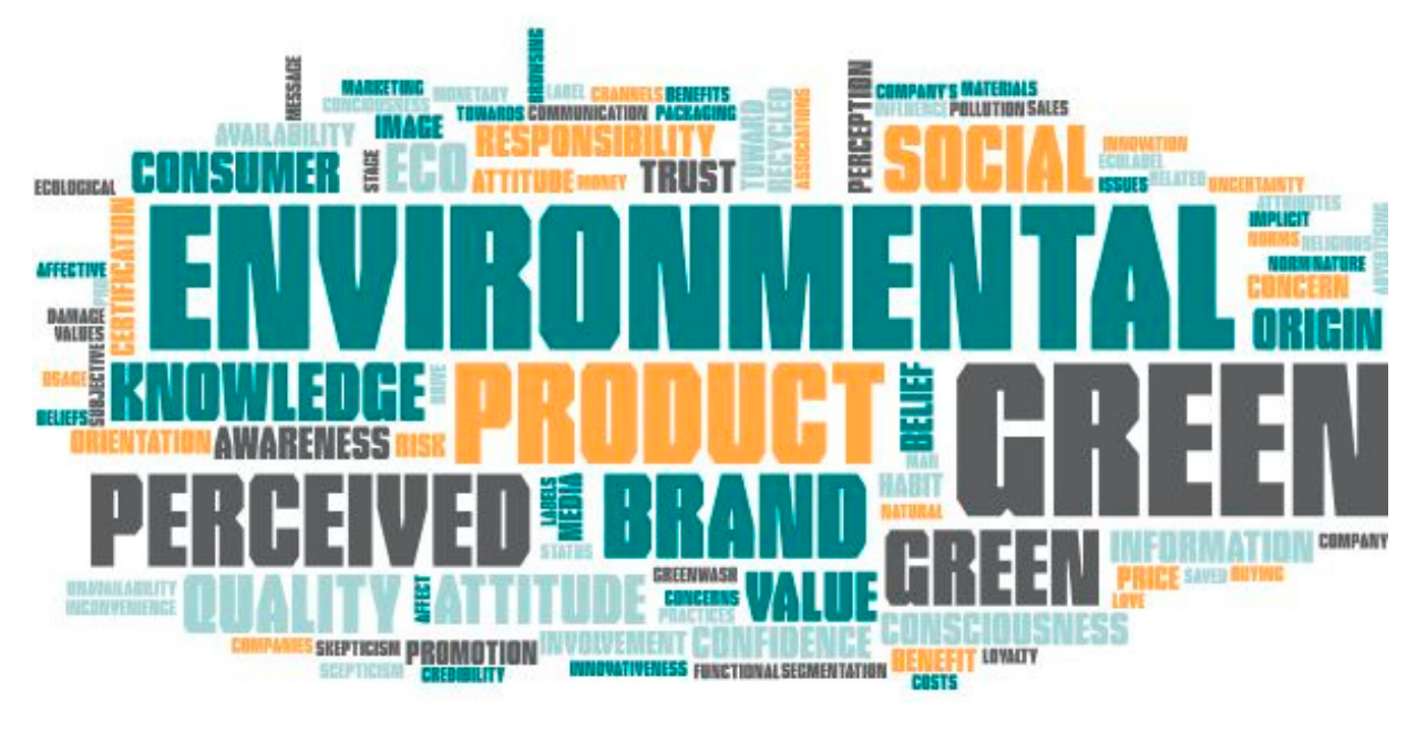
Figure 3. Factors influencing consumer behavior toward green products.

The analysis of the reviewed papers revealed a series of factors that can influence consumer behavior toward green products. 111 factors were analyzed, with most of them being quite similar in form and meaning. However, the authors of this paper were able to group these factors according to their form and meaning into eight main categories: social norms, natural environmental orientation, a company's perceived green image, green product characteristics, perceived risks and inconvenience of buying green products, perceived benefits of buying green products, institutional trust, sociodemographic characteristics, and consumer confidence (Figure 3):