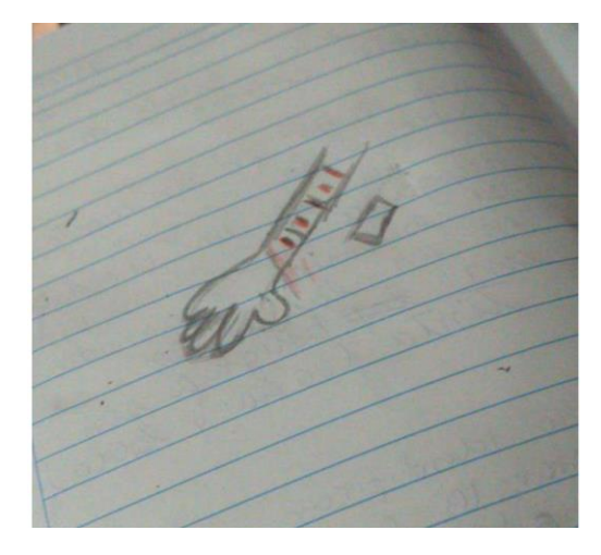
Figure 4. Drawing of self-harm as a manifestation of depression by a young adult.

Other frequently reported manifestations were self-harm for anxiety in adolescents and depression in one young adult (see Figure 4) as well as behaviors of defiance and opposition to authority figures in the family, school, and neighborhood as a symptom of depression and anxiety among both age groups. Yelling and avoiding social interactions also reflected depression and anxiety, respectively.