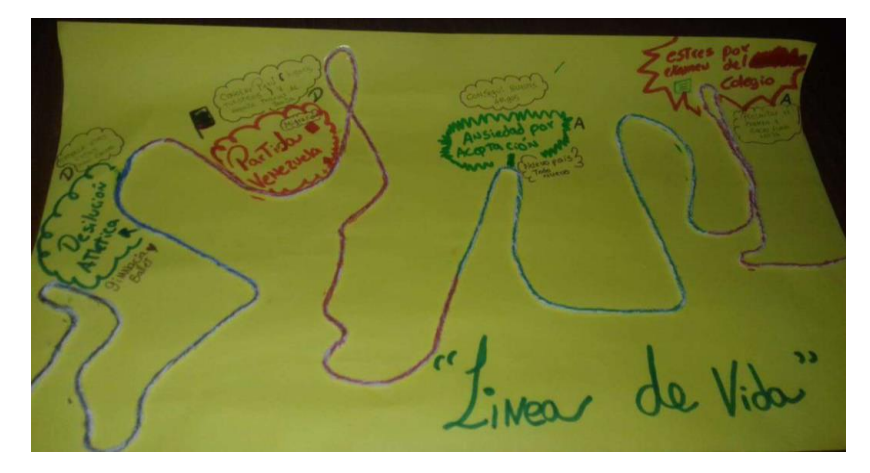
Figure 3. Lifeline drawn by a male adolescent.

Finally, the participants wrote eight narrations (four by adolescents and four by young adults) about the events identified in the lifelines, detailing actions, people, spaces/contexts, and times of the onset of symptoms in the plot of the narration. These elements made it possible to identify the triggers of the symptoms of anxiety and depression and the underlying and consequent factors to these, in addition to the different types of associated symptoms.