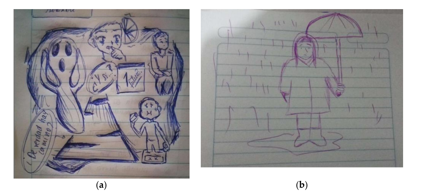
Figure 2. (a,b) Images of anxiety and depression drawn by an adolescent and a young adult.

The 18 images presented by the participants included illustrations downloaded from the Internet and the participants' drawings (see Figure 2a,b). Most of the main characters in these images were people, followed by animals, things, and places. At the denotative level, we identified that participants associated symptoms of depression or anxiety with actions such as lack of appetite, difficulty sleeping, and self-harm, among others. At the connotative level, the images evoked emotions or feelings such as emptiness and loneliness.