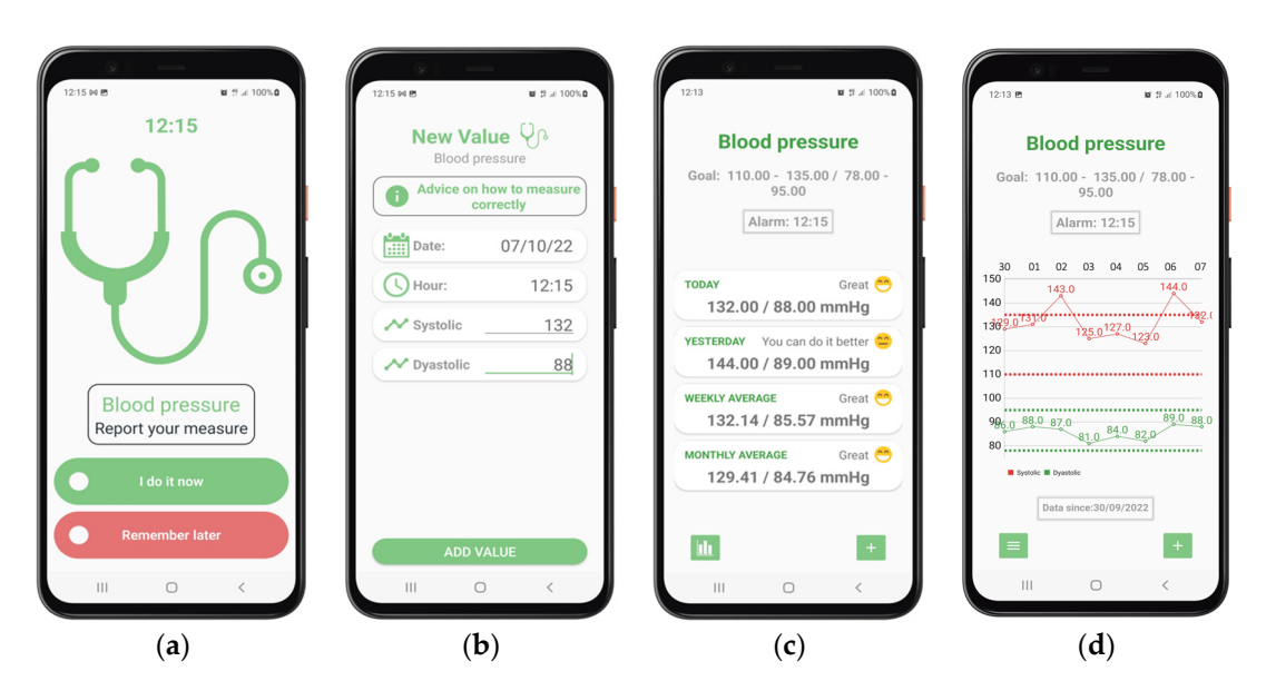
Figure 2. Some screenshots from the TeleHealth system—patient's view (mobile app): ( a ) Blood pressure alarm; ( b ) Blood pressure data input; ( c ) Blood pressure evolution summary; ( d ) Blood pressure evolution detail. Higher-resolution screenshots are available as Supplementary Material.