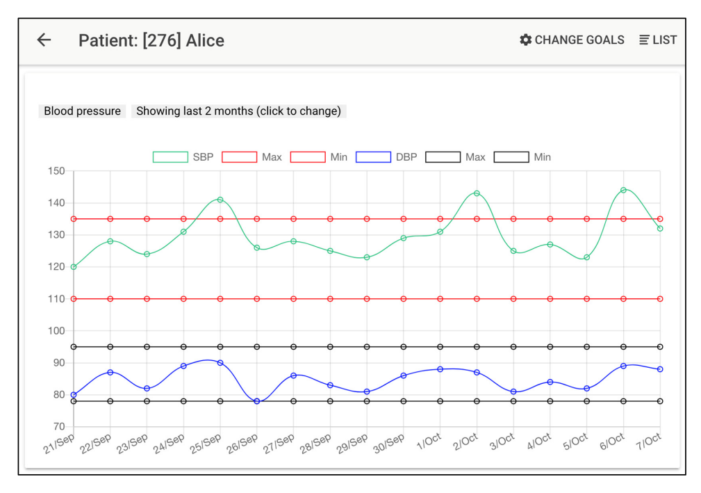
Figure 3 . TeleHealth system: professional's view (control panel). Available as Supplementary Material for better visualization, together with additional screenshots.

Figure 3 shows the professional's view (control panel), where they can remotely monitor their patients' data. This screenshot shows the evolution of the patient's blood pressure, showing values and allowed ranges according to the agreed goals. The data that the doctors can visualize include: